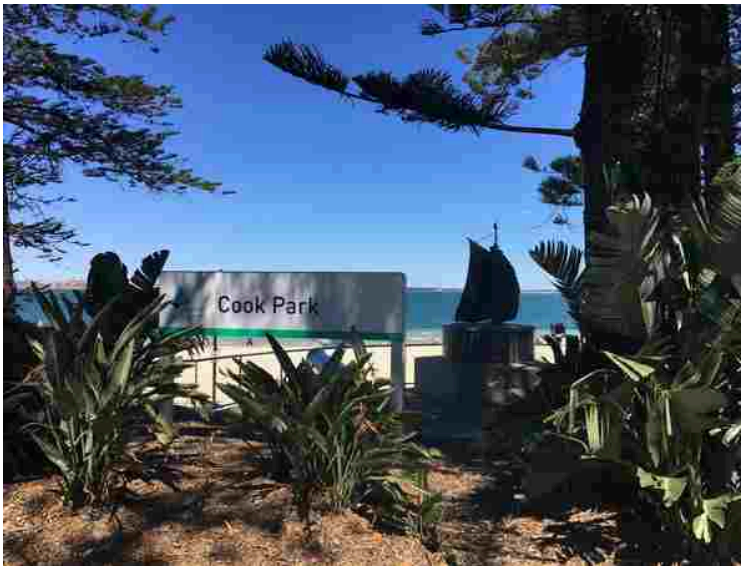
Figure 3: Looking towards the Heads of Botany Bay (Kamay) from Cook Park, Bayside Council, Sans Souci, 2020.

journalist Stan Grant, a Wiradjuri man, argued for historical accuracy. He contested the inscription on the statue, which states that Australia was discovered by Cook in 1770, a description that for him aligns with the national narrative of Australia's discovery by the British, and omits recognition of the country's Indigenous inhabitants. Intense debate followed this article, with some politicians sounding the alarm over the rewriting of history. Meanwhile, this example highlights how national imagery in Australia is undergoing a phase of contestation and enquiry about the meaning and connectiveness of national narratives (Giovanangeli and Snepvangers 2016).