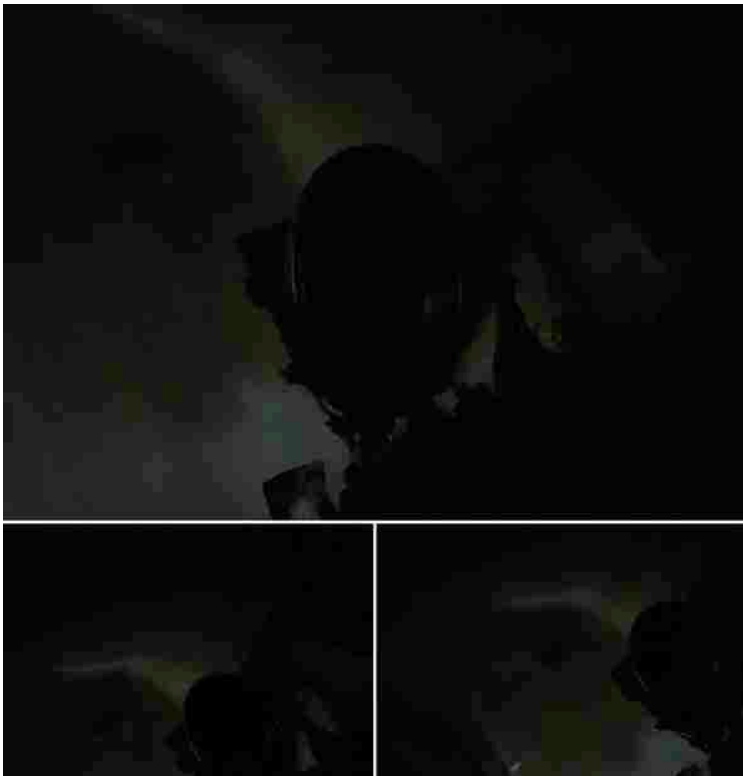
Figure 1: The Mirror in My Room, 2020.

Anzaldúa’s Coatlicue state of using the mirror and the morning shadows, light, and seeing through an experience is taken up quite literally in my work in Figure 1. The addition of shadows to mirror work