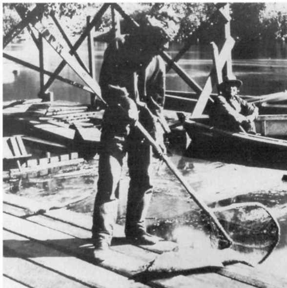
McCloud Wintu tribespeople assisted in salmon egg-collecting operations at Baird Station on the McCloud River, California, during the 1870s and early 1880s. Photograph ca. 1882.