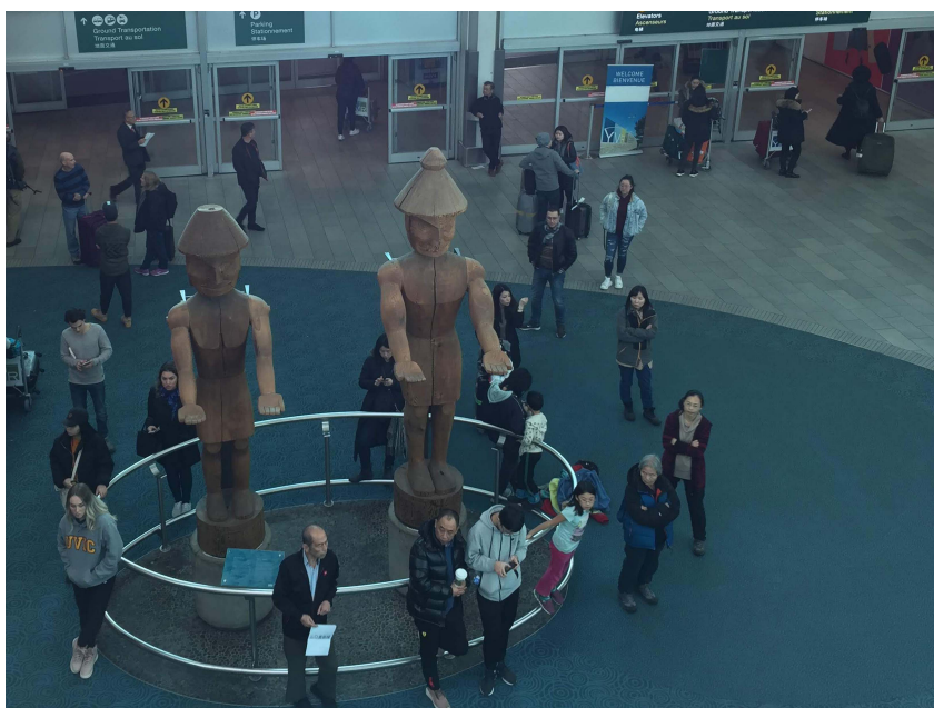
Fig. 4. Joe David, Welcome Figures , 1986, sculpture, red cedar, Vancouver International Airport.

510 Toronto's airport references regional institutions through curatorial showcases, and it has included cultural displays representing local museums, such as the Royal Ontario Museum and the Museum of Vision Science. 26 In this space, works are sited at different heights, thereby surrounding travellers as they navigate through its spacious atria. These include Jetstream (2003) by local artists Susan Schelle and Mark Gomes, an aluminium, granite, and bronze installation that hovers over travellers' heads, through swirling lines that evoke wind currents and weather patterns.