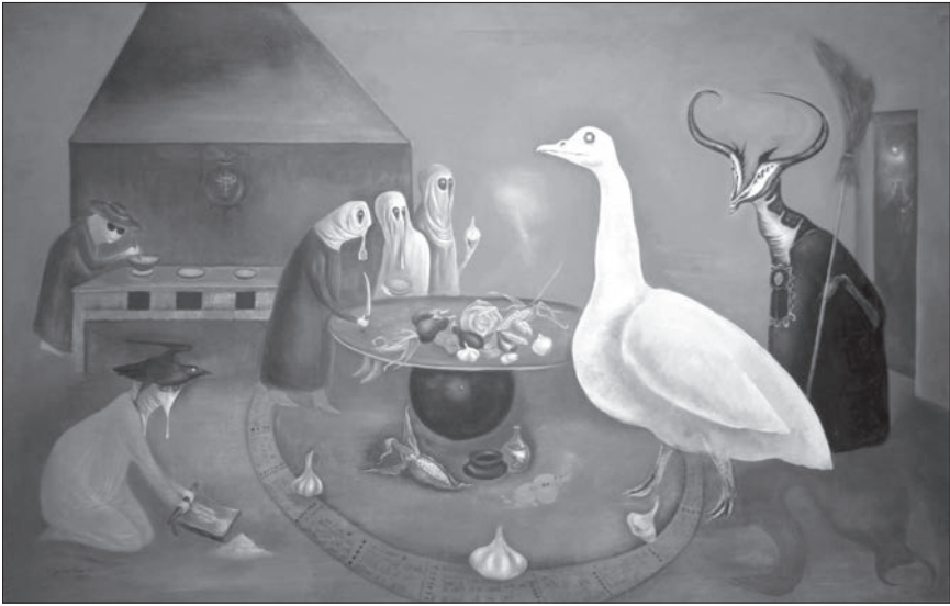
Fig. 3: Leonora Carrington, Grandmother Moorhead's Aromatic Kitchen, 1975, oil on canvas, 79 x 124.5cm, Charles B. Goddard Center, Ardmore, Oklahoma, USA.