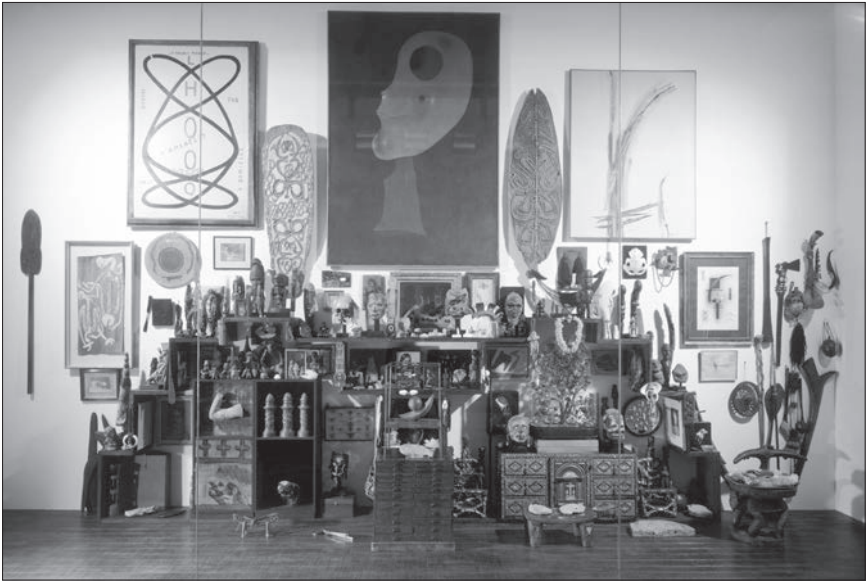
Fig. 2: Reconstruction of the wall of André Breton's studio on rue Fontaine, Paris. Musée National d'Art Moderne, Centre Georges Pompidou, Paris. Paintings by Miro, Picabia, Giacometti: © Artists Rights Society (ARS), New York.

indexed and photographed. 22 This recategorization—with its definitive separation of primitive from modern, high art from popular art, painting from text—does more to dissolve the studio's archival, or meta-archival, function than even the sale itself.