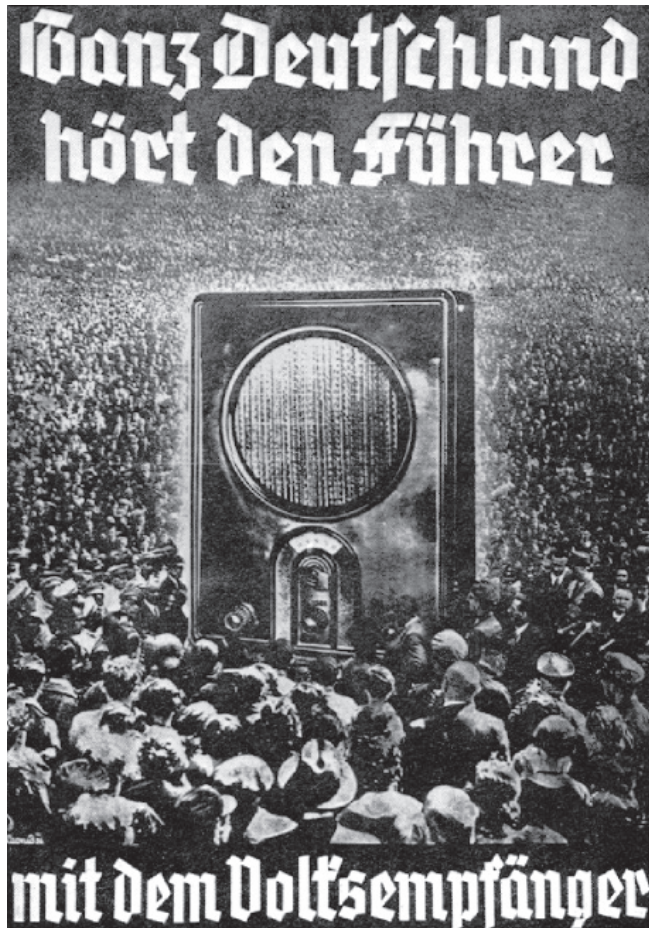
Fig. 5. Promotional poster for National Socialist German radio as a means of linking the nation with its leader, a goal that NS television developers sought to serve. The text translates: "All Germany hears the Führer on the People's Receiver" (ca. 1943-1945).