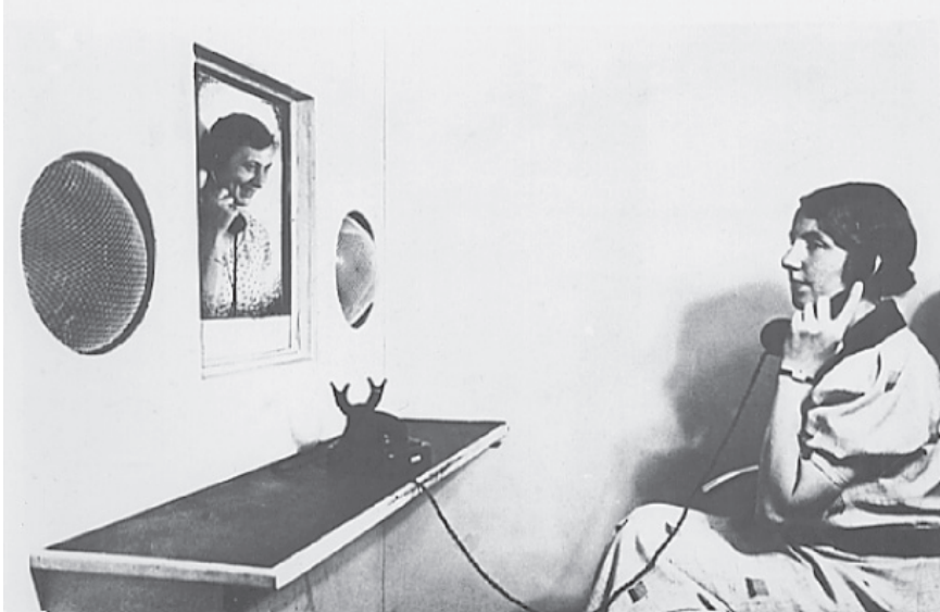
Fig. 4. Promotional photo for Germany's television-telephone service which connected post offices in major cities during much of the National Socialist era (ca. 1939).

rhythms and flow of daily life through a live feed would render the need for persuasive pre-produced programming content (the domain of the Propaganda ministry) redundant. In this case, control of the nation's neural networks, the ability to direct its gaze and forge a live connection between viewer and world viewed, provided the double advantage of superceding the impact of whatever propaganda program texts might be cast before the viewing public's eyes and perhaps even more importantly, served the project of electronically forging a Volkskoerper —a nation, a people, bound together by the synchronicity of experience. The responsible postal authorities were acutely aware of the added value of bridging the gap between subject and object, and the live televisual link promised to conjoin both in a manner that far superceded the capacities of storage-based media.