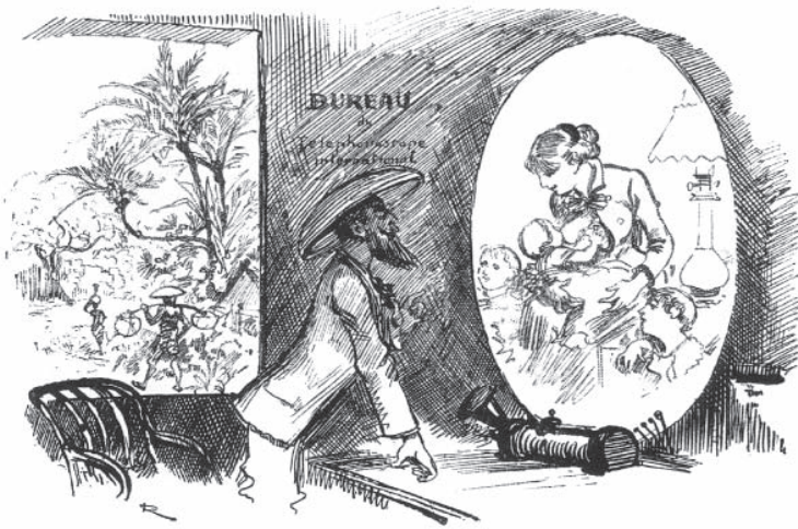
LA SUPPRESSION DE L'ABSENCE.

Fig. 2. Imaginary media: the téléphonoscope in a scenario that supports patriarchal presence in geopolitical and domestic settings. (From Albert Robida, Le vingtième siècle , Paris, Éditions Georges Décaux, 1883)