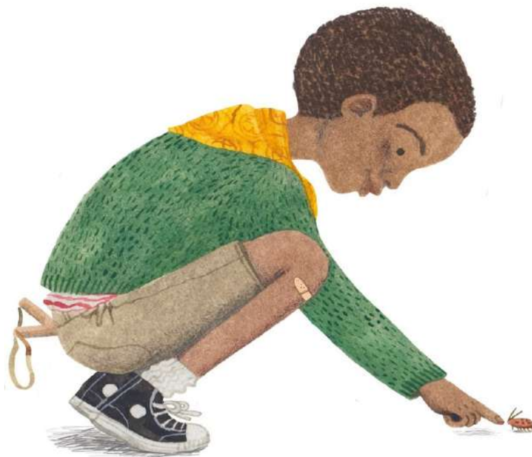
Figure 15: Clugston (2016) Young Children and Material Entanglement

To further situate this project, it is helpful to remind ourselves that for sociomaterial studies “the central premise is that the social and the material are entangled and together constitute everyday life. That is, knowing and learning, identities, activities, and environments are understood to be sociomaterial enactments” (Fenwick & Edwards, 2013, p. 372). Figure 2 , below, was designed to showcase the entanglement of young children and the materials, here the textiles, already present in their lives. This illustration will hopefully engage you with what is an otherwise flat document, and elevate the textiles for one imagined child in the preschool classroom. It becomes a little easier to imagine how the children might have acted on the textiles, and how the textiles might have acted on the children, when we focus in on a layered child/textile illustration. We can see that the child illustrated below is wearing layers of clothing, the clothing is in motion (for example, the underwear is peeking out, despite the hope that underwear will remain “under”), the child is in motion (for example, crouching and pointing), and those moments are what the illustration places under our gaze for further consideration.