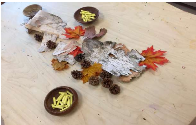
Figure 14: Sample provocation featuring birch bark, pine cones and yellow chalk

In operation since the early 1980’s, Gather Round is a non-profit childcare centre in a coastal Canadian city. As a demonstration site for a local early childhood educator training program, it is host to many students and interns. Gather Round is one of three centres in the area that feature this mentorship design and, as such, staff report high levels of job satisfaction, with the average teacher employed for five or more years. While Gather Round features three separate classrooms, in the preschool classroom, where this study was situated, up to twenty-two students and four teachers learn together.