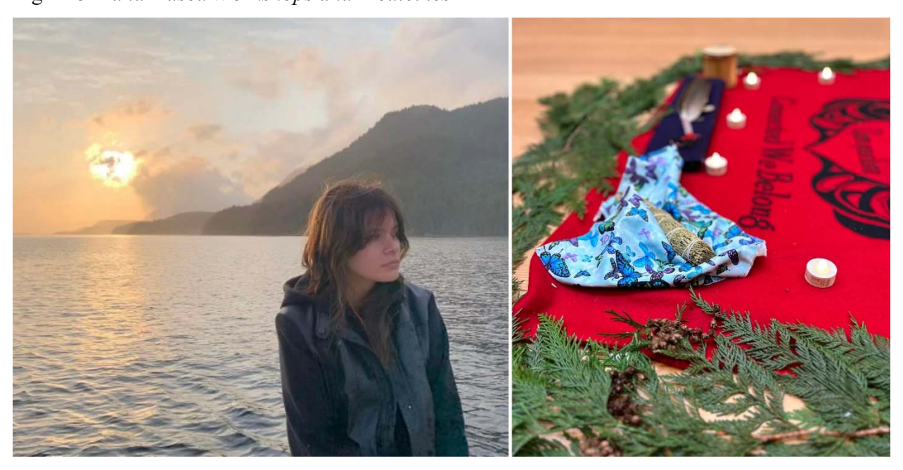
Figure 5. Land-Based Workshops and Medicines

There are so many benefits to the INVINCIBLE project, including showing our power and connections as youth in care. Another important benefit is that taking part in this kind of research is fun! I feel as if I learned a lot. It's fun to be creative, work in the community, show everyone what we have to offer, and learn some cool new skills.