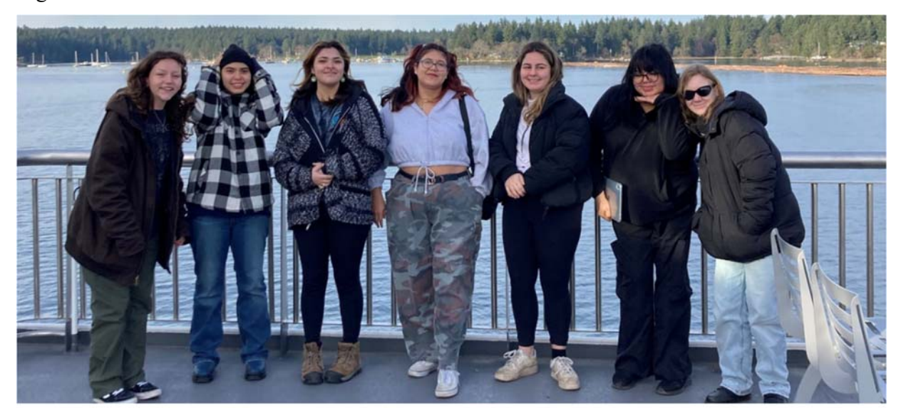
Figure 7. The INVINCIBLE Crew

My personal experience is that youth in care don't have a lot of opportunities to do things like this. These opportunities don't come often, unless we're lucky enough. So we want to share with other youth that you can do this, we have a lot to say! Even if you were not given the best hand in life and you didn't have a good start, there are opportunities out there like this, and a lot of us are doing really great with our lives and we have success. We want other youth to know that we are creative, we are storytellers. We want them to feel empowered to be loud and let everyone know that we're still here! And we're awesome!!