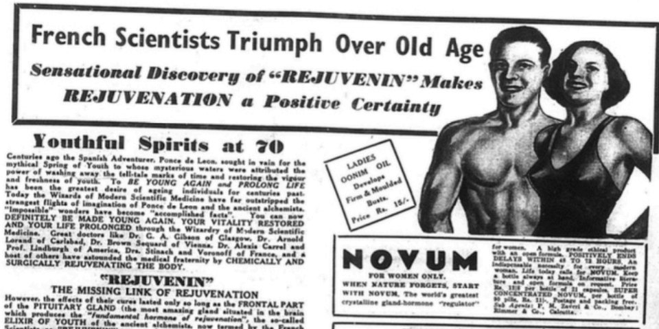
Figure 3: "French Scientists Triumph Over Old Age: Rejuvenin" advertisement in India Illustrated Weekly Calcutta, 1938 (Anon. 1938g).

mass produces a variety of rasāyana compounds from its headquarters in Kottakkal. 95 Indigenous medicines were seeing something of a revival in respect or at least acknowledgement of a continued usefulness, particularly highlighted by the patronage of nationalist figures such as Malaviya.