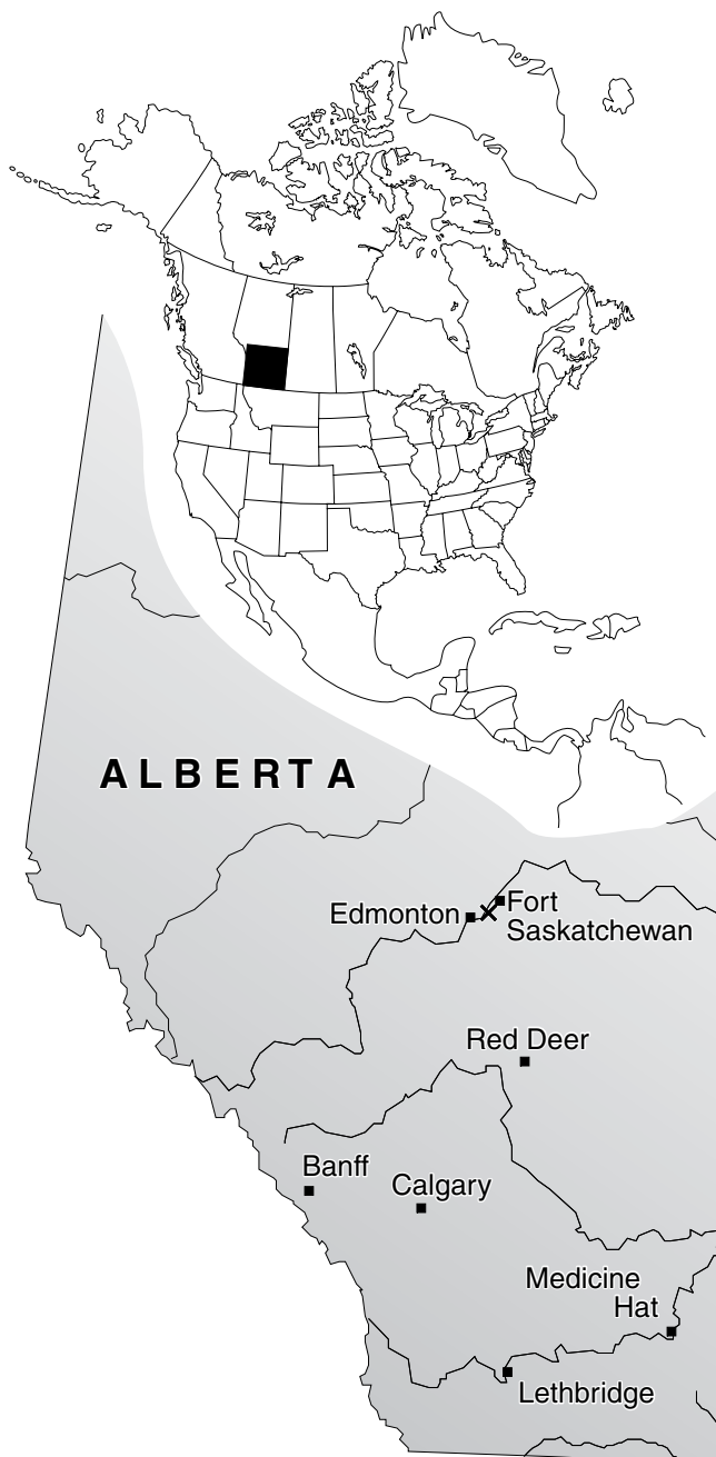
FIGURE 2. Location (X) of Bootherium bombifrons between Edmonton and Fort Saskatchewan.

Site d'origine du spécimen de Bootherium bombifrons (indiqué par un X), entre Edmonton et Fort Saskatchewan.