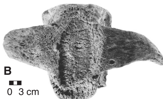
FIGURE 1. A) Posterior view and B) anterior view of Bootherium bombifrons.