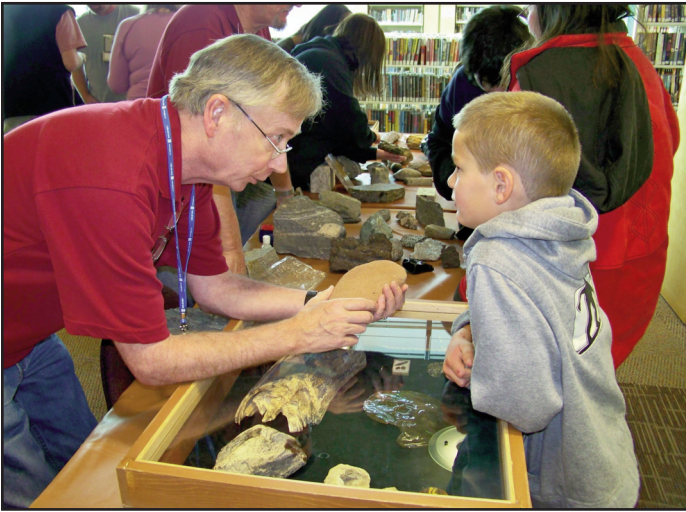
Figure 1. Interactions with earth scientists, focused on discussions of actual geological specimens, are key elements to the success of the Rock ‘n’ Fossil Road Show.

adapted by other research institutions interested in fun and effective public educational outreach programs.