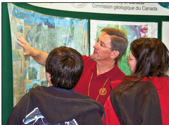
Figure 2. General interest posters, such as Geoscape Calgary (Poulton et al. 2002; Turner 2013), are an important part of the displays at each Rock ‘n’ Fossil Road Show.