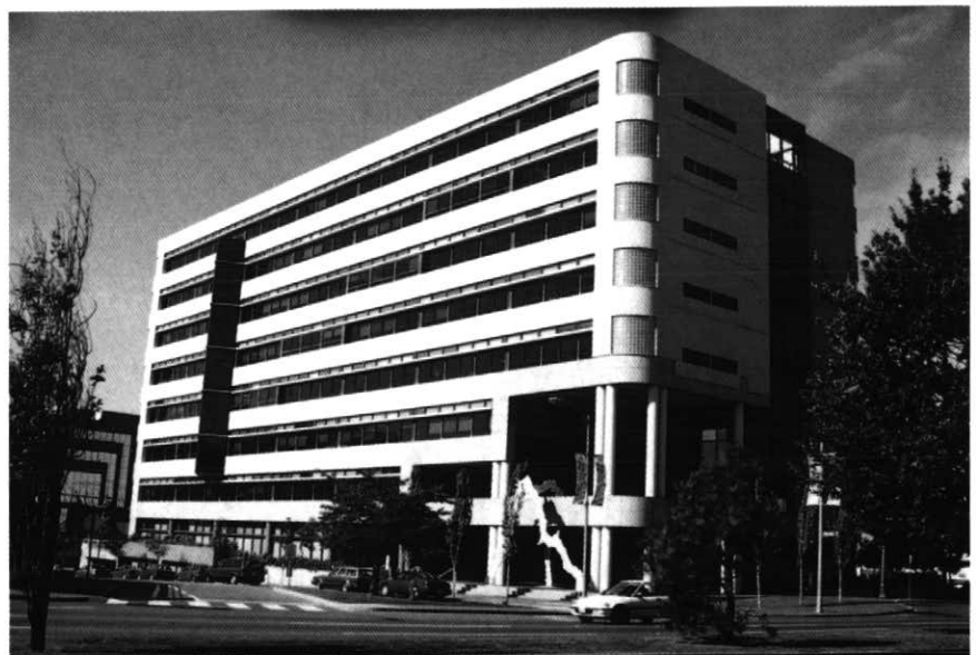
Figure 9 Jack Davis Building, Victoria, occupied by the Ministry of Mines and Petroleum Resources in 1993 (now the Ministry of Energy and Mines), with the Geological Survey Branch located mainly on the fifth floor.