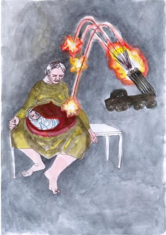
Figure 5. Vlada Ralko, from the Kyiv Diary series, 2013–15, gouache, watercolour, ballpoint pen on paper, private collection, courtesy of the artist.

In Ralko's opinion, one of the most ravaging effects of war is on female subjectivity, for it questions its core and reduces it to hollowed-out symbols, like the Soviet motherland that requires the ultimate sacrifice from its children (Ralko). In one of the drawings of the series, Ralko effectively undermines the symbol by radically incarnating it. A strong and menacing female figure with the body structure of a Neolithic goddess, who looks very real in her contemporary underwear, stands on black soil, firmly propped by a shovel, preparing to bury dead soldiers piled in a heap nearby. The artist revisits the symbols herself, disturbing the war narrative by introducing a character inspired by the Ukrainian folk rag-doll, lial'ka-motanka , that traditionally served as a protective charm. On Ralko's painting the oversized