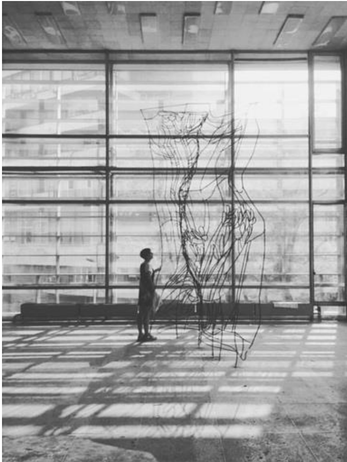
Figure 10. Anna Zvyagintseva, Namaliuvaty svoje vikno, zim"iaty papir ( To Draw Your Own Window, to Crumple the Paper ), 2015, bar reinforcement, welding, iron wires, The School of Kyiv, Kyiv Biennial, 2015, photo by Oleksandr Burlaka, courtesy of the artist.

The Order of Things demonstrates the fragmentation and dissipation of reality inflicted by the trauma of war. Zvyagintseva renders her old drawings of women walking with children or picking flowers by welding metal, demonstrating the fragility of everyday life by contrasting the coarseness of her material with the delicacy of her drawing style. Yet even the sturdiest of metals cannot withstand the brutality of war. We notice how the contour is broken and the metallic lines are falling, creating by chance some crude