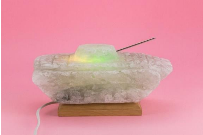
Figures 12, 13, and 14. Lia Dostlieva and Andrii Dostliev, Zalyzuiuchy rany viiny ( Licking War Wounds ), 2016–21: week 1, week 167, week 240 (the final week), courtesy of the artists.