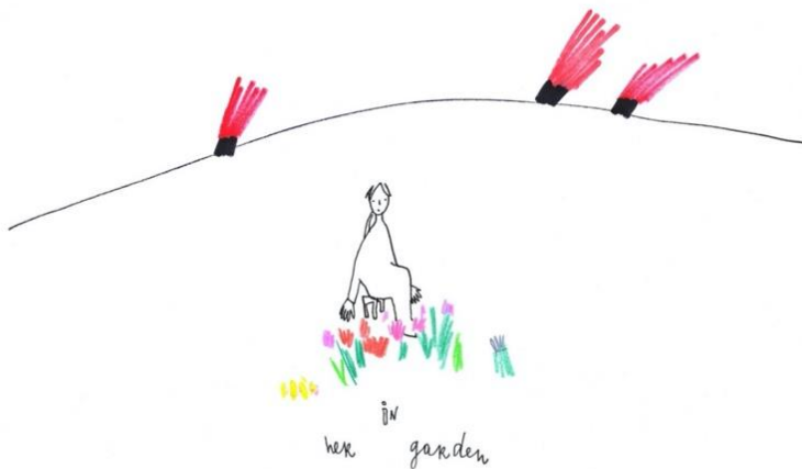
Figure 8. Alevtina Kakhidze, “In Her Garden,” marker and colour pencil on paper, 2014, courtesy of the artist.

The garden is another character in Kakhidze's series. It is featured on its own or as a background for stories of war that disrupt Klubnika Andreevna's regular chores. In a drawing titled "In Her Garden," the horizon is circled as if universalizing the garden and turning it into a globe on which Klubnika Andreevna sits surrounded by colourful flowers. The horizon, however, is attacked by red explosions that the figure ignores, ever focused on her flowers. On another drawing with a similar horizon, Kakhidze gives her viewers more details of the garden, with a tree captioned as "plum" and the plot of land captioned "garden," with a row of carrots next to it. Klubnika Andreevna is hiding from the shell fire that is ravaging the horizon; the caption to the entire image voices her story: "Vse iz-za morkovki poshla v ogorod v tot den" ("The carrots are to blame; because of them, I went to my garden that day." Yet another drawing depicts a diagram of the street where Klubnika Andreevna lives, with stray dogs abandoned by their owners who decided to flee the war zone. It shows the cellar where she hides from the shell fire, her big house, and her dog Irma's little house. The proximity of Klubnika Andreevna's house to the house where a neighbour was recently killed by shell fire is indicated on the diagram. The red colour underlines the place of the explosion as well as the address of Kakhidze's mother's house,