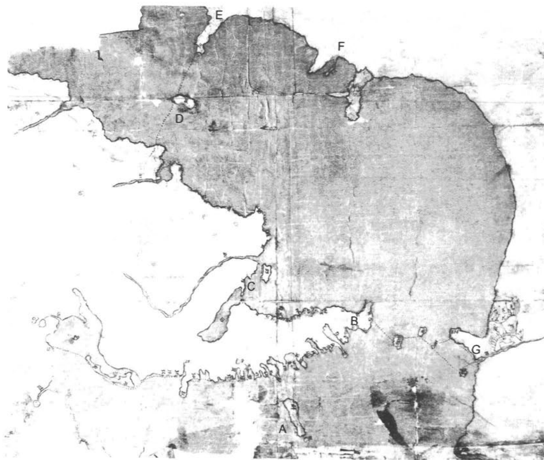
Figure 2. Nikolai Daurkin's 1765 map of Chukotka and part of Alaska showing both Bering Strait and northern (Wrangel Is., Pt. Hope) connections. Additional placenames: A) St. Lawrence Island, B) East Cape, C) Kolyuchin, D) Wrangel Island, E) Point Hope, F) Kotzebue area, G) Cape Prince of Wales.