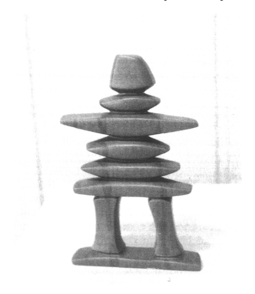
Figure 2. One piece inuksuk model.