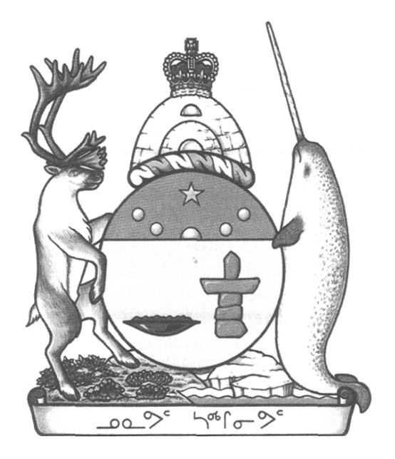
Figure 4. Nunavut's coat of arms.