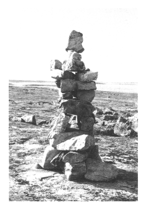
Figure 1. Close up of traditional inuksuk, near Puvirnituq, Nunavik.