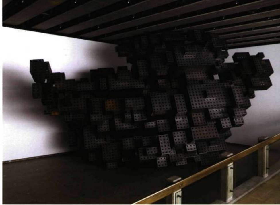
Anthony Gormley, Space Station , 2007. Corten mild steel plate. Courtesy of the artist and Jay Jopling/White Cube, London. Photo: © Stephen White

A downstairs gallery contains row upon row of concrete blocks. These blocks were scaled to the body size of actual citizens of the Swedish city of Malmö. Allotment II (1996) as the piece is titled is like a city of built forms, each the size of a human body, generalized into geometry. There are dark openings, orifices of the body; a mouth, two ears, an anus or genitals, again rectangles or cubes.