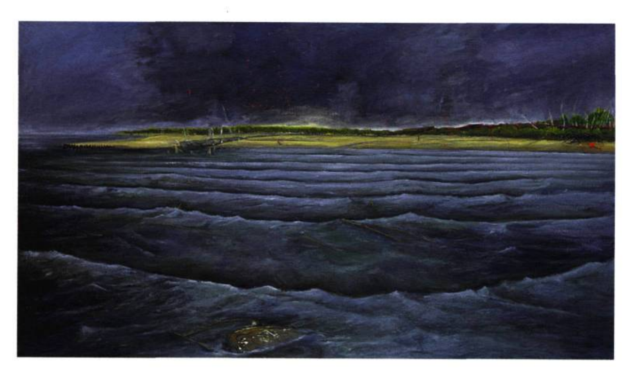
David Holl, Castaway, 1999. Oil on canvas; 109 x 189 cm.