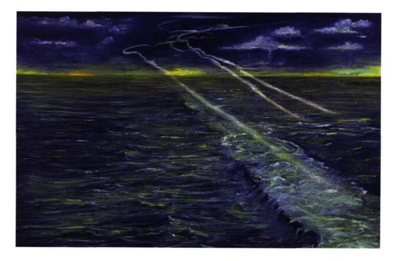
David Hall, Wake, 1999. Oil on canvas; 136 x 206 cm.