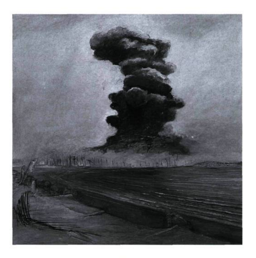
David Hall, Plume, 1999. Oil on canvas; 138 x 134 cm.

water. The ice is scratched, as is the painting's surface. Hall has painted traces of something that passed over, that has scraped the icy surface – a sled or a more destructive tool of human intervention.