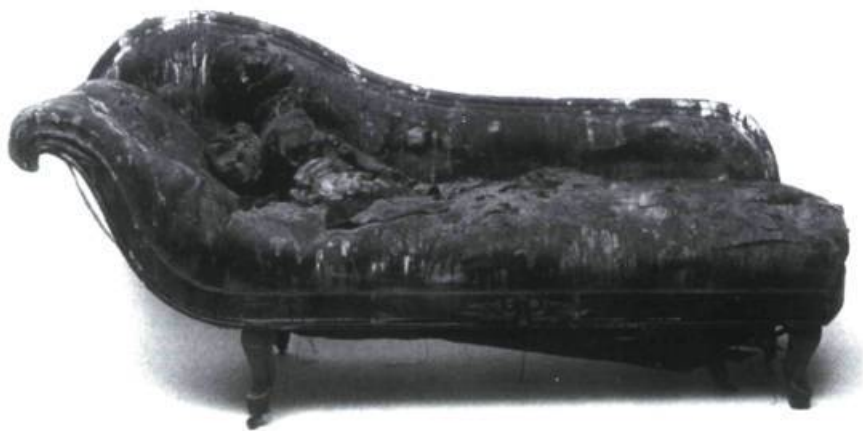
Bruce Conner, Couch , 1963. Cloth-covered couch with wood frame, cloth, paint. Norton Simon Museum, Pasadena, CA.

seeking kicks and love and satori, getting high on jazz and junk and booze and poetry.