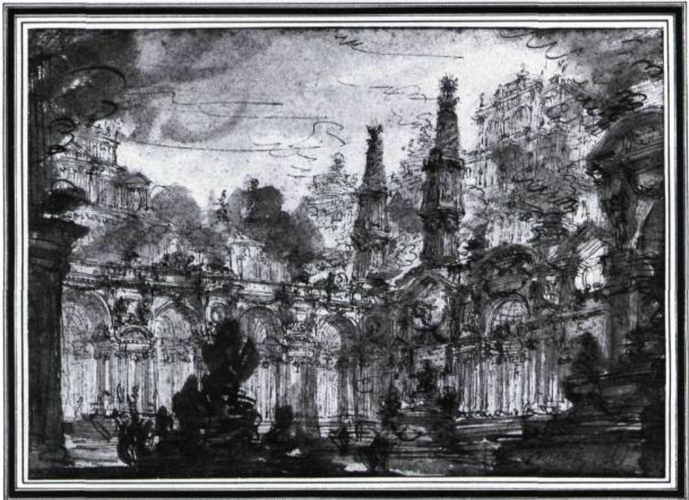
Giovanni Battista Piranesi, Fantastic Monuments , 1747-1750. Pen, brown ink, brown wash over graphite underdrawing on cream laid paper; 19,8 x 27,7 cm. Collection : Canadian Centre for Architecture, Montréal.