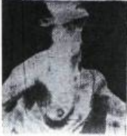
Angèle Verret, Donné , 1992. Acrylic on canvas; 213 x 163 cm.

l'image la plus facile à reconnaître, la plus facile à identifier avec l'original."