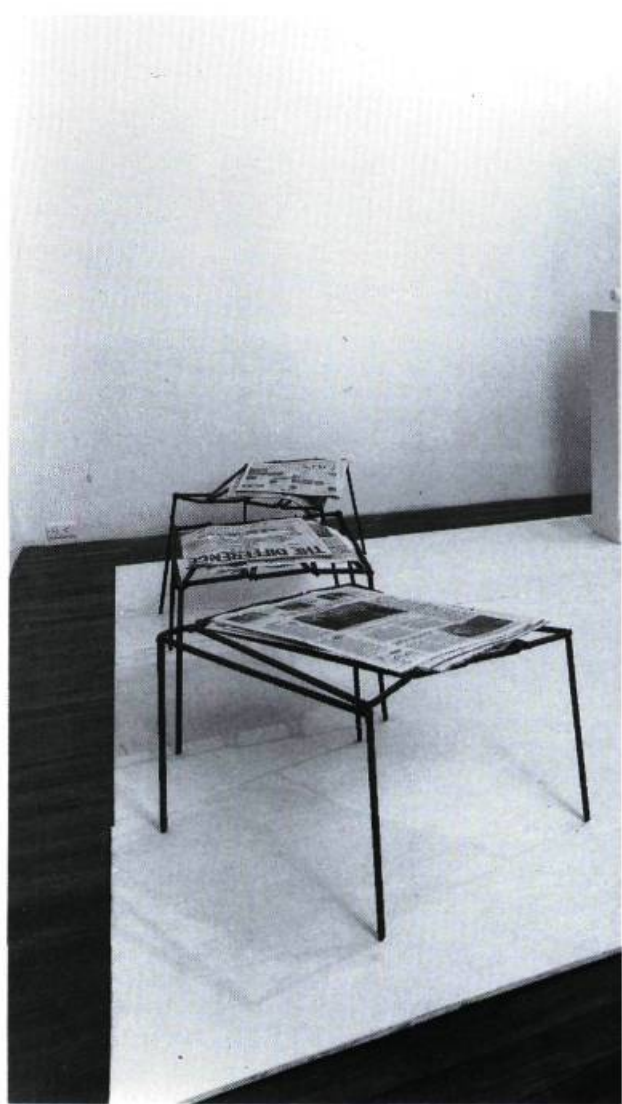
Franz West, installation, 1993. David Zwirner Gallery.

This conceptual predisposition to unearth the hidden material of psychosis, and, as a sculptor, make it physically