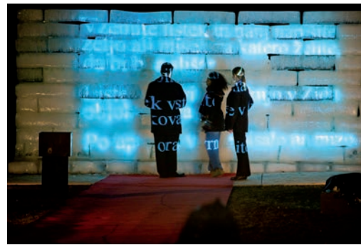
JANEZ JANŠA, THE WAITING WALL , NOVO MESTO, SLOVENIA, 2011.