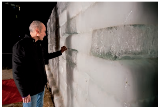
JANEZ JANŠA, THE WAITING WALL , NOVO MESTO, SLOVENIA, 2011.