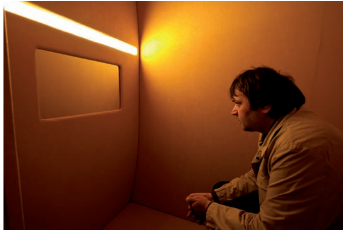
JANEZ JANŠA, THE WAITING WALL , NOVO MESTO, SLOVENIA, 2011.