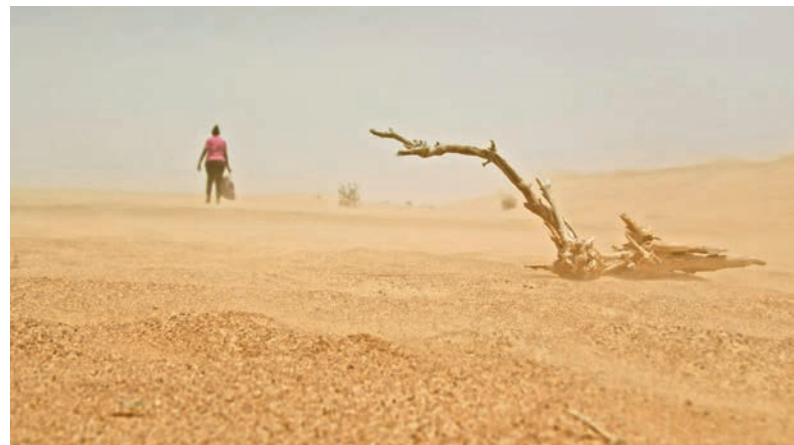
John Akomfrah, Four Nocturnes , 2019. Stills of the three channel HD colour video installation, 7.1 sound.