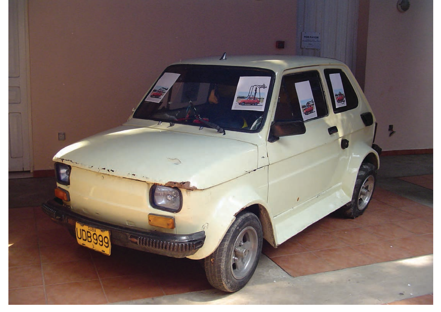
Esterio SEGURA , Submarino hecho en casa , 2012. 11ª Bienal de La Habana.