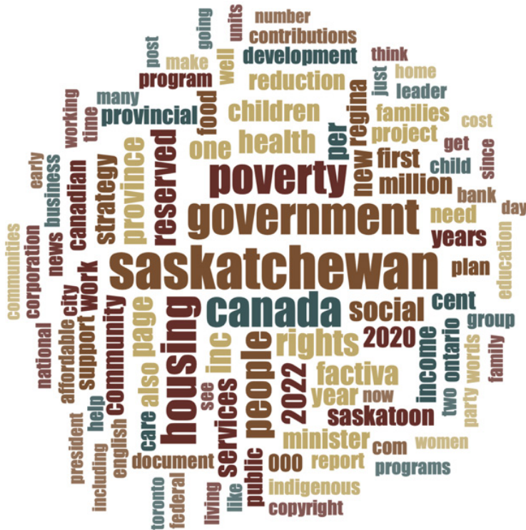
Figure 1. Word Cloud based on media articles.