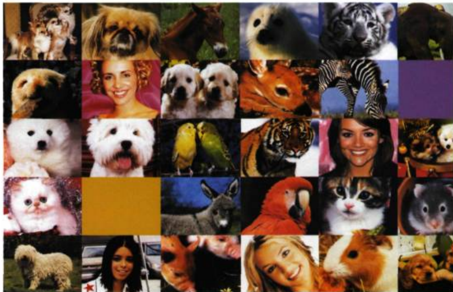
© Francis Summers, The Real Deal

Only the work of Jaar broke with this Western ethnocentrism. The blindingly white light that filled a wall of his installation appeared at first to be a void, a space empty of images. As was explained in a accompanying text, this void referred to the absence of images of the 1994 Rwanda genocide in the Corbis photo archive acquired by Bill