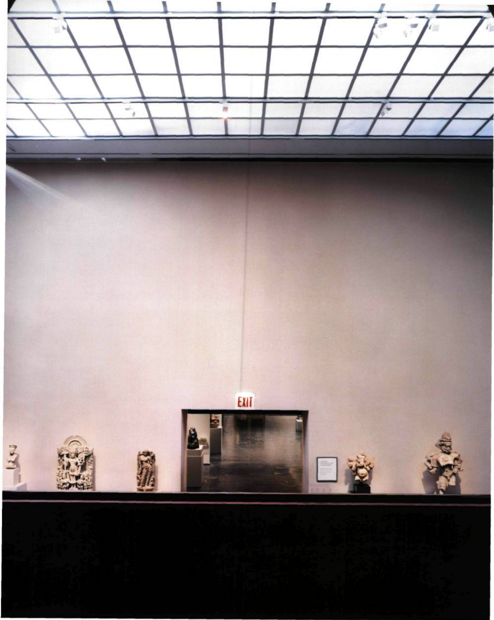
Metropolitan Museum of Art #38 Fuji chromogenic print 28 x 35.5 cm 2000