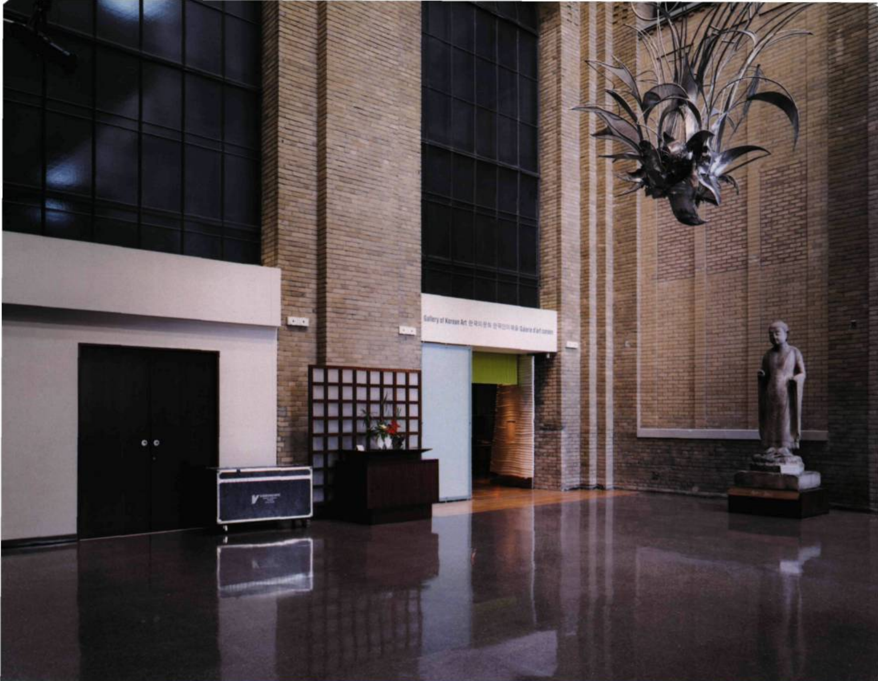
Royal Ontario Museum #22 Fuji chromogenic print 28 x 35.5 cm 2002