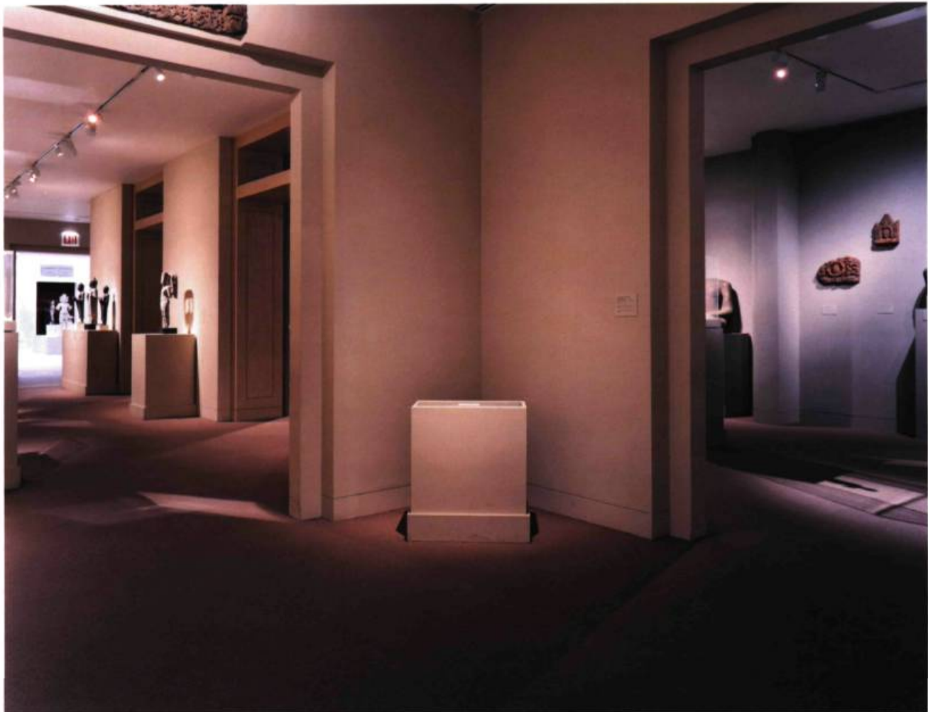
Metropolitan Museum of Art #18, #35