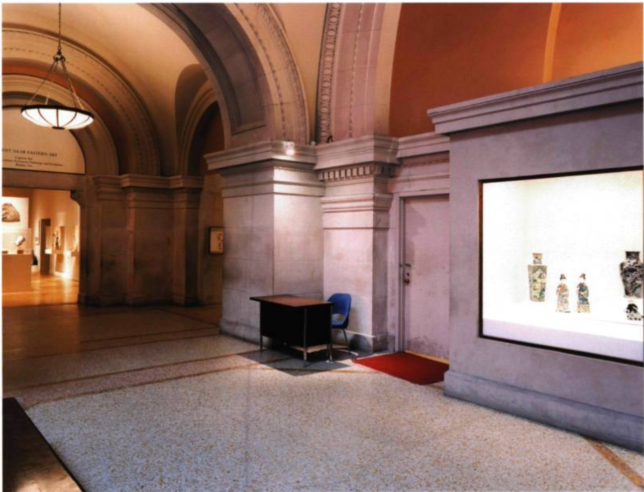
Metropolitan Museum of Art #39, #22 Fuji chromogenic print 28 x 35.5 cm 2000