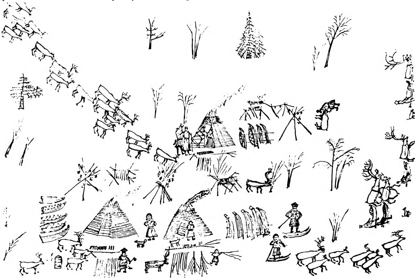
Illustration 2. This illustration shows a typical migrating group, a sii'da , consisting of three families at their campsite down in the winter pasture. As we can see, people are engaged in various activities such as watching the reindeer, cutting wood for the fire, slaughtering a reindeer, and driving away with pullas in a rái 'do (caravan). Despite its awkward perspective this simple drawing conveys some accurate ethnographic information about the Sámi culture.