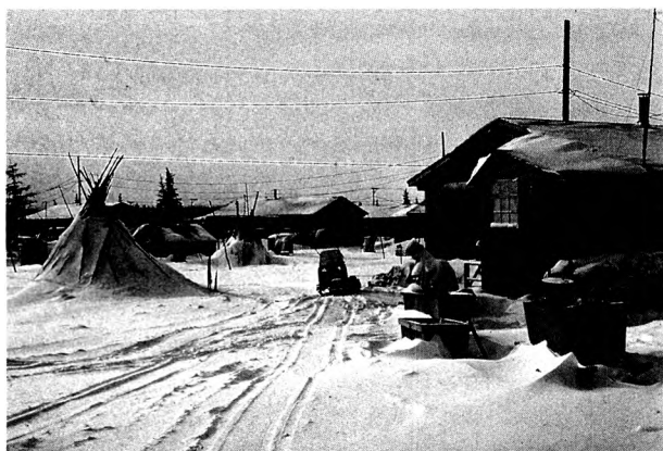
Wemindji houses. A traditional tipi ( müchiwaahp ) is often built nearby for cooking with the open hearth. During the past decade, construction of settlement housing has provided a substantial portion of seasonal employment taken by men who hunt most of the year.