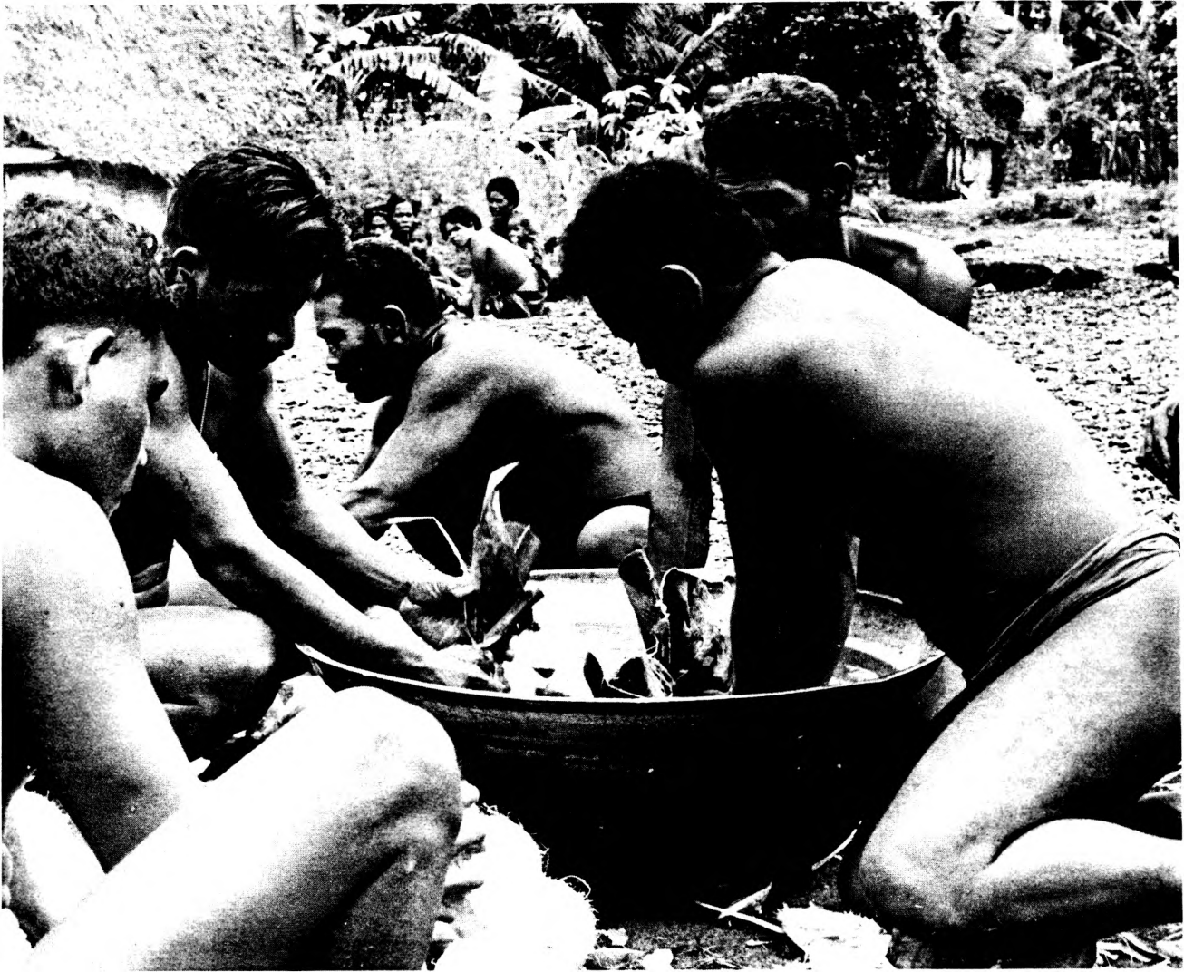
Saufalachig medicine preparation, Lamotrek, 1962-63.

divination are as follows. The diviner takes a single frond pinna and strips in lengthwise with his thumbnail into four ribbons. He ties a random number of knots into each of these strips while reciting a chant directed to the spirits of divination that aid him in his diagnosis. The chant is in the form of a question asking if a particular spirit (or class of spirits), for example the spirit of iloulimvaaiu , is causing the sickness. If the omen is positive then the interpretation is that the named spirit or spirit class is in fact responsible for the illness. If the omen is negative, the diviner repeats the process and inserts a new name in the chant. Generally the diviner will not randomly proceed through the names of all known illness-causing spirits. Rather he approaches the problem in a more logical fashion, beginning with the names of those spirits that are known to cause those illnesses with the specific symptoms that have been described to him.