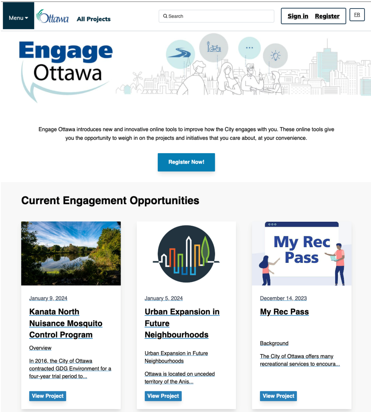
Figure 1. Screenshot of “Engage Ottawa” Dedicated Digital Engagement Platform Built Using EngagementHQ

regional governments across Canada serving populations over 5,000 (local municipalities are the cities, towns, villages, townships, rural municipalities, or other types of local government entities; regional municipalities, where they exist, are groupings of