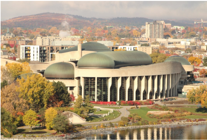
Figure 3. Ottawa. Photographer: Rachel Barber. Used with permission.

are actually codified, and whether they are being protected or violated in practice. While some of the chapters go beyond description and put forward more developed conceptual arguments, most of them remain largely descriptive or testimonial, rather than theoretical. The conceptual connections to Lefebvre's right to the city in particular are not evenly clear and fleshed out across all chapters, making the book more a collection of examples about rights in the city. The volume would have benefitted from a closing chapter to bring all contributions back to this opening idea.