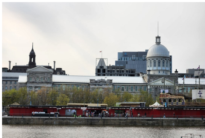
Figure 1. Montreal.

The third part of the book examines themes that did not seem to fit the other sections, and the title Other Rights in the City does not help readers to see what thread connects these final chapters. In chapter 7, Michelle L. Oren and Rachelle Alterman