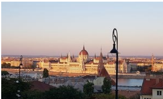
Figure 2. Istanbul.

summarize the results of a content analysis of UN member state constitutions to assess how/if the right to adequate housing is legally protected. Chapter 8, by Eran S. Kaplinsky, examines property rights in the municipal context, with emphasis on the mechanics of land expropriation and compensation to landowners. Finally, Ola P. Malik and Sasha Best discuss the tensions and policy implications of protecting freedom of expression in public spaces while ensuring the protection of people’s dignity and group identity, advocating for the regulation of “othering” speech.