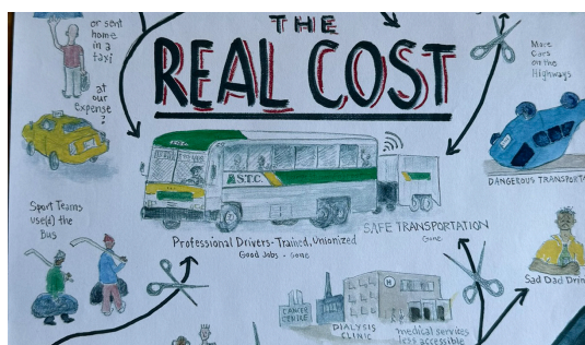
Figure 2. Poster Created by Jan Norris for Save STC