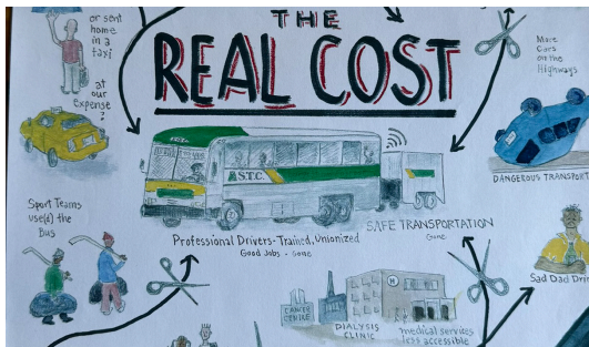
Figure 2. Poster Created by Jan Norris for Save STC