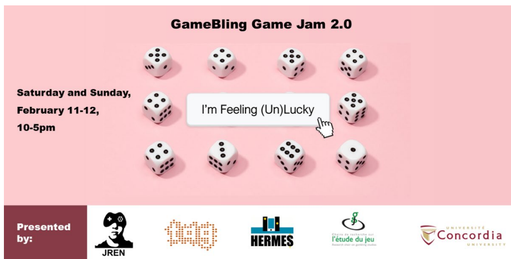
GameBling 2.0 event banner.