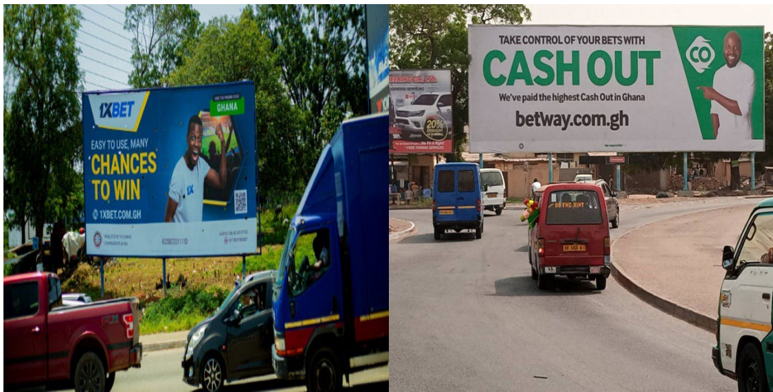
Figure 1. Two examples of betting billboards on the streets of Accra.