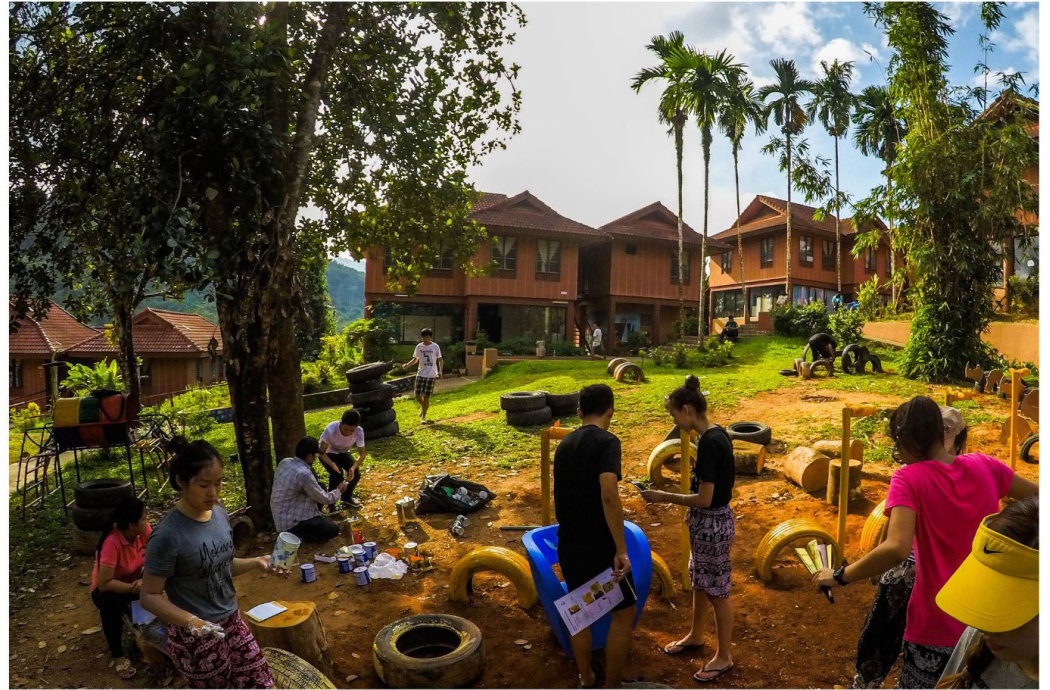
Figure 2: Building new playground and refurbishment projects at Yaowawit School, Phang Nga, Thailand.