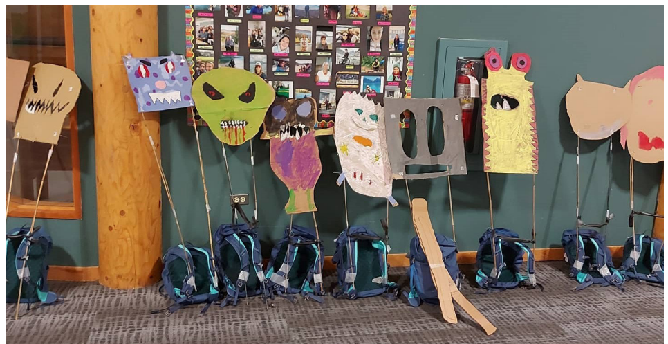
Figure 2. October 29, 2021, Elijah Smith Elementary School, student-made monsters mounted on backpacks await the parade.

Outdoor programming can be more resilient in the face of the unexpected than indoor programming. Those involved are already dealing with the unpredictability of the weather, and so more mentally prepared to