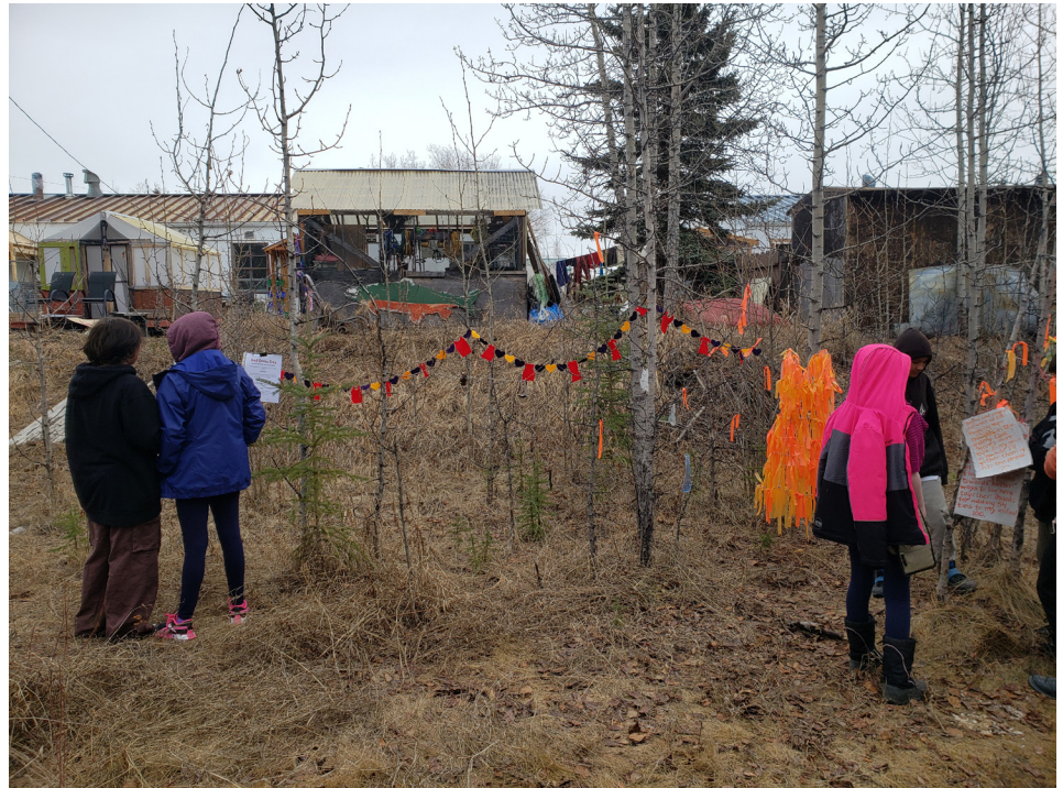
Figure 7. On Red Dress Day, May 5, 2023, students from Elijah Smith Elementary School in Whitehorse install their felt banner and poem in the Dalton Trail Trail Gallery. Relationships between the artist and the school opened up the possibility of them using this space to express themselves.

||||| " Relationships set the preconditions for surprising futures...Saying yes to the students' request is an easy act of supporting their artistic agency, and a moment built of our previous interactions, our relationship." |||||