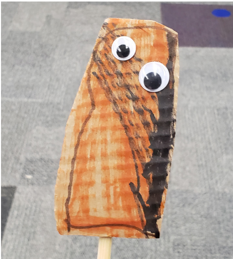
Figure 4. Hundreds of monsters at a variety of scales from a variety of schools amassed into a lively installation in the Atco Electric Yukon Youth Gallery in the Yukon Arts Centre, Whitehorse, May 2022. Many of the monsters paraded as part of the Midnight Sun Moppets Children's Festival on the Yukon Arts Centre grounds on May 29.