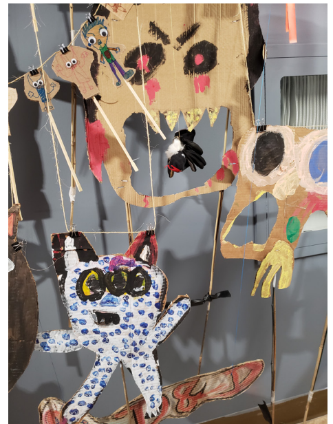
Figure 3. Playing with scale: miniature monsters made on chopsticks allowed us to experiment with parading in video format, and to adapt the project to different ages and time frames. Elijah Smith Elementary School, October 2021.

My hard no is "overcoming" the monster. I will accept risk to the monsters, and damage due to their use, but not demonization and violence towards them. This is not a battle. These are our own created cardboard demons, drawn from the delightfully surprising brilliance of children's imaginations. I love these monsters. I will not participate in demonizing them, still less in some kind of ritual murder.