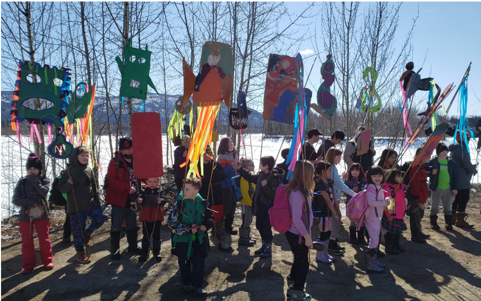
Figure 1. All 48 students from the J. V. Clark school in Mayo paraded their monsters down to the River on one of the first fine spring days of April, 2021.