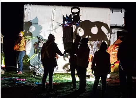
Figure 6. Shadow puppet monsters in the Instagram booth at the Nakai Theatre Puppet Path at the Wondercrawl Festival, Shipyards Park, Whitehorse, September 2022.