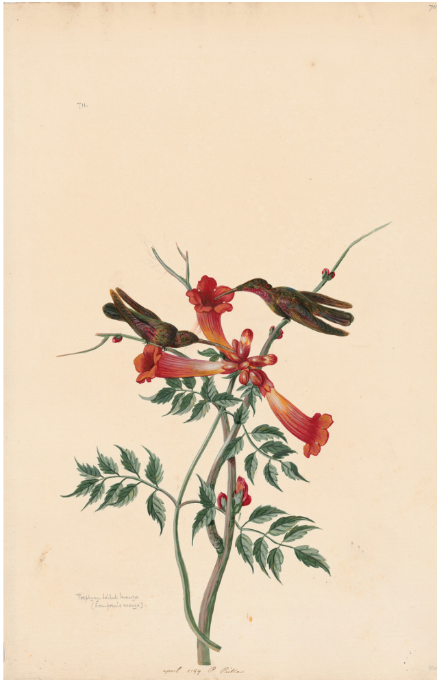
Figure 5. Peter Paillou, “Porphyry-tailed Mango” ( Anthracorax mango ), watercolour and gouache on paper, 1754. Blacker Wood Collection, Rare Books and Special Collections, McGill Library, MSG BW002-711.

postures, Paillou must have painted some birds or mammals from living creatures, but he was obliged to paint many more from dead and mounted specimens or skins, and the depictions suffer as a result. Despite his popularity, even Paillou’s best work cannot compare with that of Collins, who professed to be not only a painter but also a watcher of birds and did indeed breathe life into his subjects.