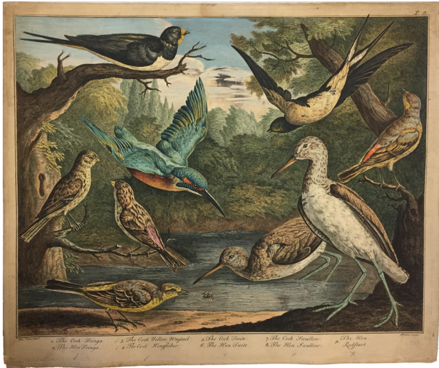
Figure 4. James Mynde, after Charles Collins, Icones Avium, cum nominibus anglicis , P. 8, hand-coloured engraving, 1736. Blacker Wood Collection, Rare Books and Special Collections, McGill Library, elf QL674 C655.

in the Icones but are now painted life-size in full colour, perched on artistically twisted twigs. They are signed and dated between 1736 and 1743. At first, White must have accepted Collins copying birds directly from the Icones , but by 1738, even if a bird was featured in the Icones , Collins was preparing fresh drawings for White, more acutely observed and corrected. For example, in the Icones , Collins depicts a pair of grey wagtails, but both birds appear similar. The pair of Grey Wagtails painted for White in 1738, however, show the appropriate sex-specific breeding plumages.