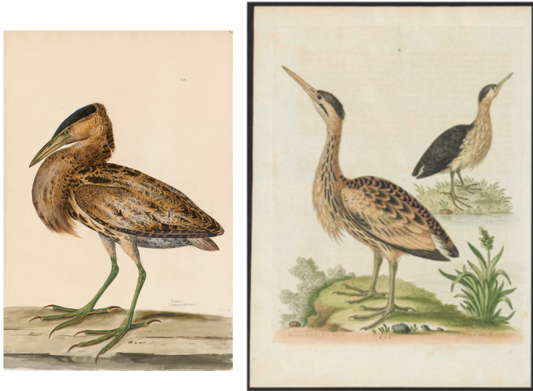
Figure 6. Left: Attributed to Peter Paillou, “Great bittern” ( Botaurus stellaris ), watercolour on paper, n.d. Rare Books and Special Collections, McGill Library, MSG BW002-740; right: George Edwards, “The Little Brown Bittern,” Gleanings of Natural History ... , Part II, (1760) Pl. 275, Rare Books and Special Collections, McGill Library.

by memory but afterwards compared my draught with the bird, and found that they nearly agreed.” 40