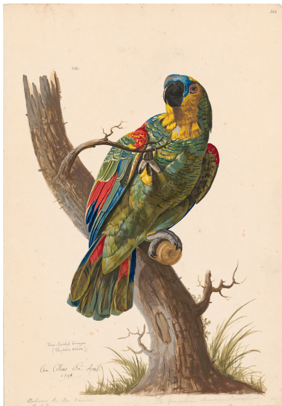
Figure 3. Charles Collins, Blue-fronted ( Amazona aestiva ), watercolour on paper, April 1740. Showing artist's signature and date; Craddock number (top right); White volume number (bottom left); Mousley identification; inscription in unknown hand (bottom right). Blacker Wood Collection, Rare Books and Special Collections, McGill Library, MSG BW002-286.