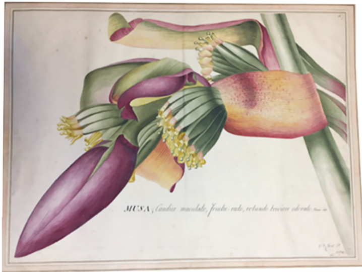
Figure 2. Georg Ehret, Musa (Banana), watercolour on paper, c1750. Blacker Wood Collection, Rare Books and Special Collections, McGill Library elf QL46 D73.

to Wood as “infantile, and worse, a crime!” 8 Wood’s purchase kept White’s zoological collections together, though sadly, the six volumes of botanical and insect drawings sold separately appear to have disappeared from public view. 9