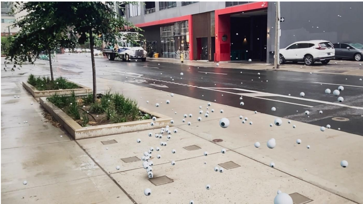
Figure 3: Under Their Eyes AR Installation—Downtown Toronto

On November 18 th , 2023, we invited participants to experience the Augmented Reality (AR) installation as a walk-and-talk activation in downtown Toronto. Participants had the opportunity to share and reflect on similar lived-experiences, events, and frictions they endured on digital spaces. The route of the installations was (poetically) selected to be in front of the Meta, LinkedIn, and Twitter/X headquarters to assert fem(me)inist digital agency and resistance.