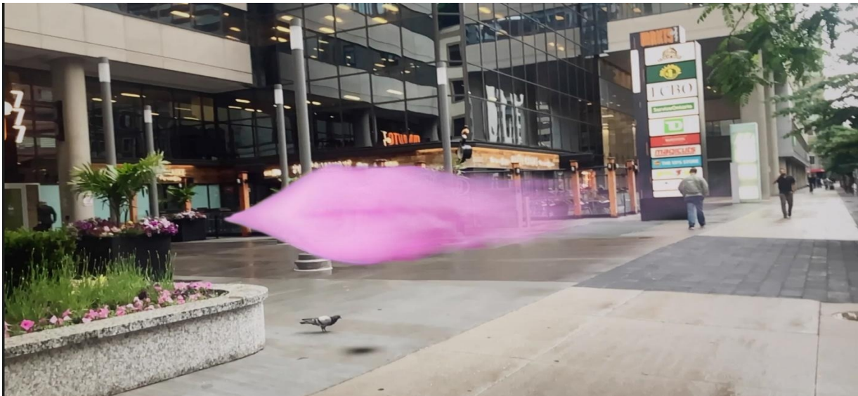
Figure 6: Hush AR Installation—Downtown Toronto