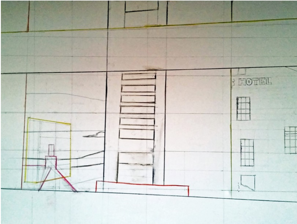
A Seat at the Table, first sketch