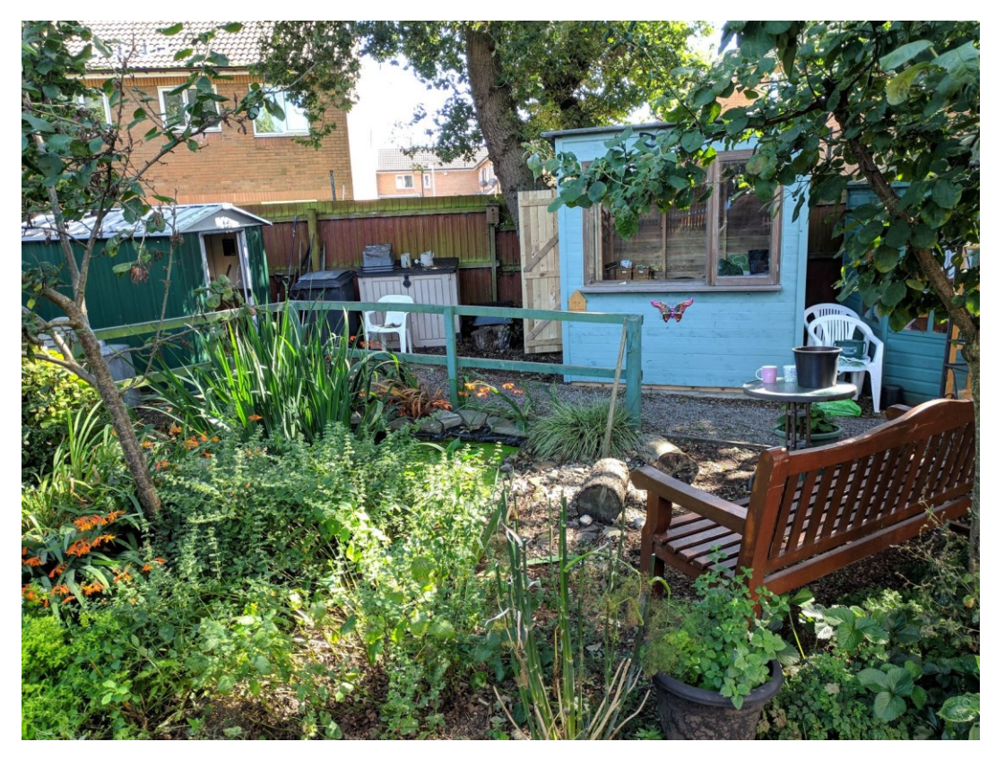
Figures 2.1 and 2.2: Resting time and social space in the community garden