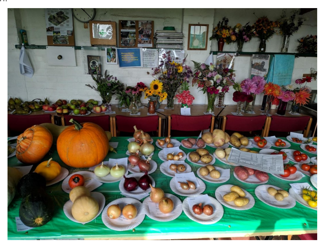
Figure 1: the vegetable competition at the allotment

Social de-alienation is evident in the sharing of seeds and tools, practices of mutual aid, learning and nourishing skills of co-operation, setting rotating schedules for watering, and collectively discussing and deciding upon plans and ideas. It refers to the basic social experiences of celebrating and mourning together, of the mundane practices of sitting around a table and drinking tea and sharing biscuits, and of dealing with the common dramas and disagreements. The annual vegetable show at the allotment, the community gardens holding a BBQ for its neighbours, and neighbours dropping off seedlings or old furniture, become significant mundane practices in the everyday act of commoning. These are far from perfect processes, but often become the site of clashing subjectivities and practices—where disagreements take place, and where distrust, frictions, tensions, and hierarches can emerge within groups. However, it is these practices of commoning (including the tensions) which constitute communities (Gibson-Graham, Cameron, and Healy 2016), sometimes of strangers coming together (Huron 2015) but also of nourishing pre-existing communities. But this social life occurs in specific spaces—thus social de-alienation requires processes of spatial dealienation.