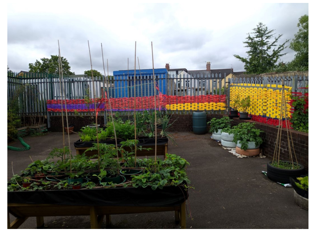
Figures 3.1, 3.2, and 3.3: Mundane creativity and repurposing old materials

Gardens are filled with such examples of commodities becoming repurposed–from composting food waste to building raised beds and sheds from scraps. For De Angelis (2017), this is an example of autopoiesis within the commons, which refers to the appropriation of resources from the capitalist circuit for the reproduction and expansion of the commons. Autopoeisis was also apparent in the way that people used their skills acquired during their working lives, re-directing them towards non-commodified means in the gardens. For example, retired steelworkers and construction workers were able to fix machinery in the allotment, and a retired plumber was able to install a sink and plumbing in the kitchen/committee room. While people were able to re-appropriate or re-direct skills learnt in the workplace, people could develop new skills and practices that were neglected or latent during their working lives. This is often a social process of deciding what to do, how to do it, and then pooling these diverse knowledge and skills to carry out this collectively.