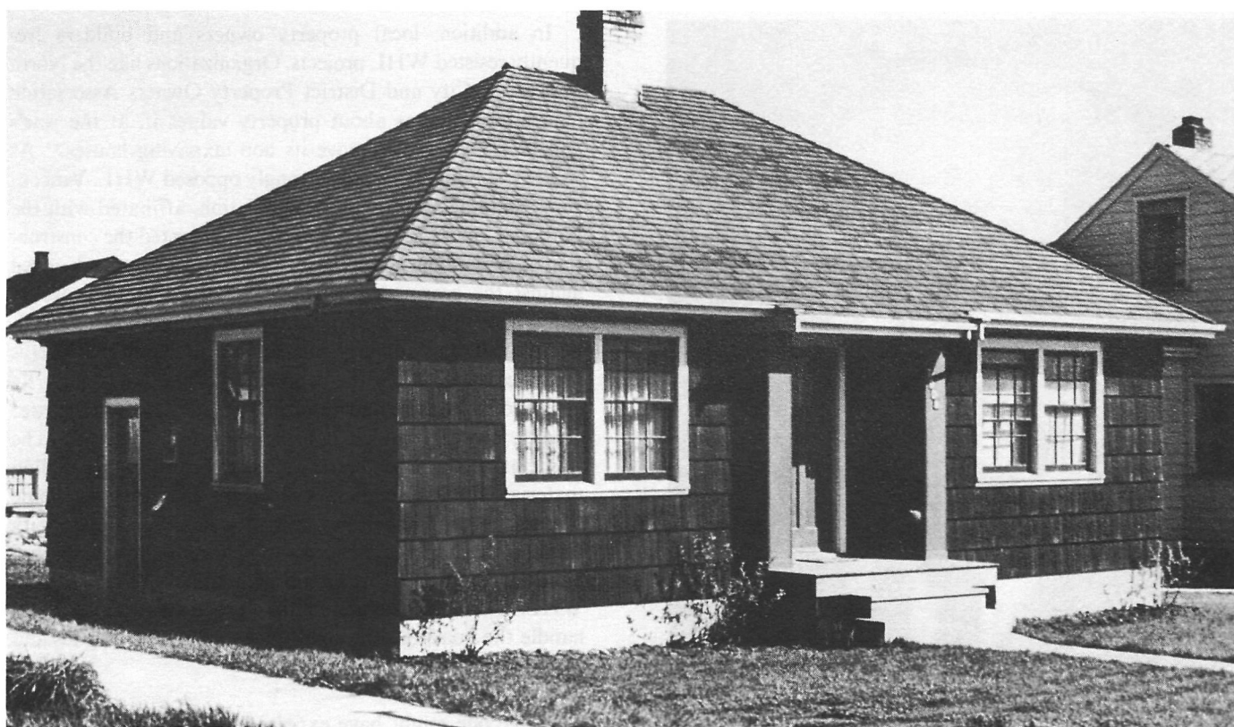
FIGURE 3. House type H-21 in Vancouver.

While municipalities regarded wartime and post-war housing conditions as a national problem requiring a federal government solution, WHL encountered many local obstacles to the implementation of its programs. By May 1945, Pigott reported to WHL shareholders that, on the whole, smooth municipal relations had replaced earlier "very troublesome" 77 dealings. In fact, many municipal governments reserved "hostility," or at best "passive tolerance," for WHL projects. 78 Often, they simply resented the intrusion of a large-scale federal project into a local community. For example, general public antagonism greeted a WHL scheme for New Glasgow, Nova Scotia. 79 Complaints about a hous-