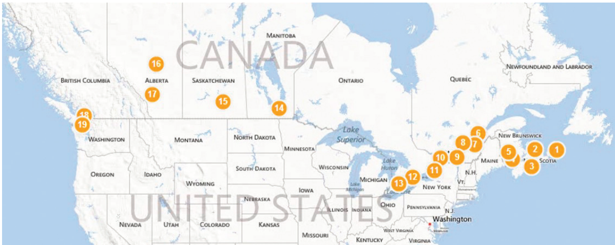
Figure 1: As a result of Privy Council Order 2389 (17 September 1914), no-fly zones were established over the following cities (1) Sydney, Nova Scotia; (2) Charlottetown, Prince Edward Island; (3) Halifax, Nova Scotia; (4) St. John, New Brunswick; (5) Fredericton, New Brunswick; (6) St. Jean, Quebec; (7) Quebec, Quebec; (8) Valcartier, Quebec; (9) Montreal, Quebec; (10) Ottawa, Ontario; (11) Kingston, Ontario; (12) Toronto, Ontario; (13) London, Ontario; (14) Winnipeg, Manitoba; (15) Regina, Saskatchewan; (16) Edmonton, Alberta; (17) Calgary, Alberta; (18) Vancouver, British Columbia; and (19) Victoria, British Columbia. Custom map created using Microsoft Bing Maps, found at http://www.bing.com/maps/ .

But even while at war the Canadian government sought to maintain an aeronautical relationship with its neutral southern neighbor. American pilots could still legally enter Canada if they followed strict security procedures. They had to apply for clearance beforehand and, upon entering Canadian territory, land immediately at one of eleven designated landing areas for inspection. After a twelve-hour waiting period American pilots could undertake their flight “within the time and by the route specified in the clearance” issued by the inspecting officer. American pilots had to return to a designated landing station for a post-flight inspection before returning to the United States. The carrying of explosives, firearms, photographic apparatus, carrier or homing pigeons, and mails was strictly forbidden. Failure to adhere to any of these stipulations could result in a $5,000 fine and/or up to five years imprisonment. 13