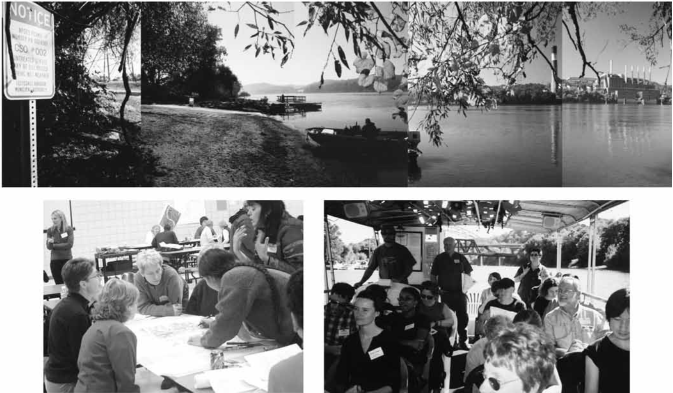
Figure 2. Images from 3 Rivers 2nd Nature: the post-industrial condition—dirty water and aging industrial infrastructure; interested parties and potential advocates on the rivers and at the public design tables. 3 Rivers 2nd Nature, STUDIO for Creative Inquiry, Carnegie Mellon University.