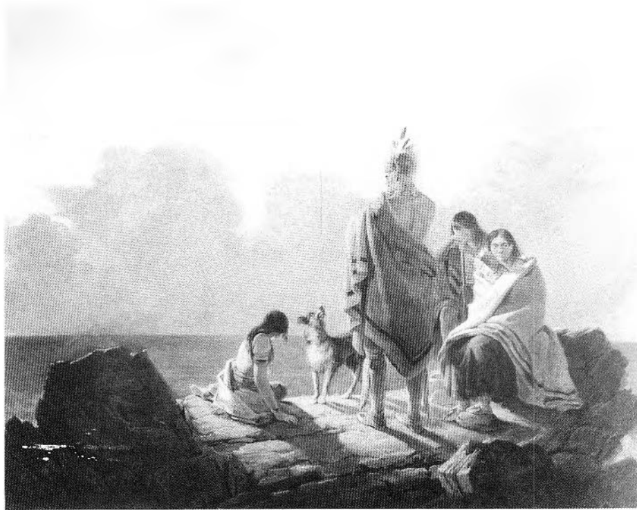
FIGURE 87. Tompkins H. Matteson, The Last of the Race , 1874. Oil on canvas, 100.9 × 127 cm. (Photo: Courtesy of the New York Historical Society, New York City).