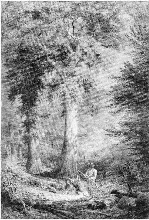
FIGURE 85. Lucius O'Brien, Lords of the Forest , 1874. Watercolour on paper, 74.3 × 49.8 cm. Art Gallery of Ontario, Toronto; gift of the Government of the Province of Ontario, 1972.