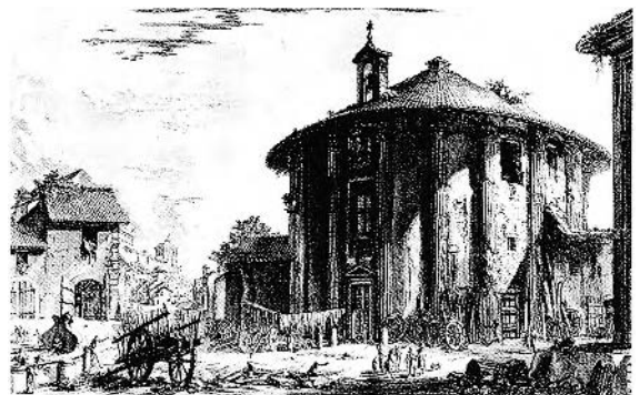
FIGURE 1. G.B. Piranesi, Temple of Vesta . From Levit.

The prints of Giovanni Battista Piranesi combined the archaeologist's passion for accurate observation with a love of grandeur, mystery, and fantasy. Herschel Levit chose forty-one plates by Piranesi, largely from his Vedute di Roma (1748 ff.), and photographed the same views in order to contrast eighteenth-century Rome with the contemporary city. The etchings and the photographs are reproduced side by side with comments by the author. They are introduced by a brief biography of Piranesi and notes on his style and methods of work.