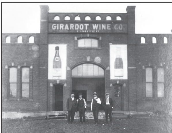
The Girardot Wine Company.