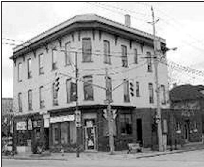
The Jules Robinet winery.