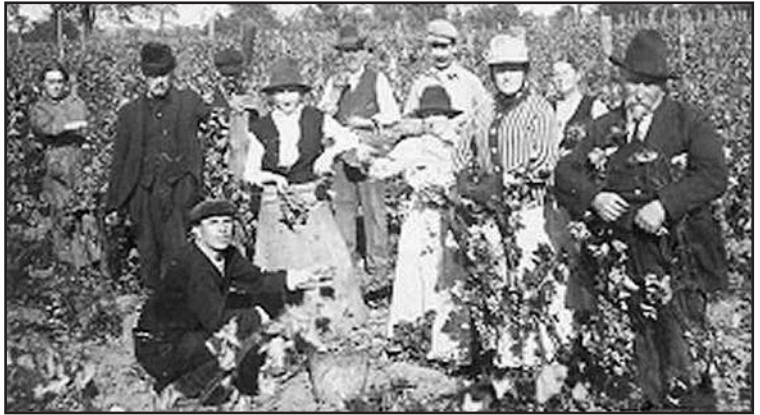
Jules Robinet Vineyard.

their choices, with some opting for emigration. Thousands of French migrants chose the United States and, for many, the Midwest offered affordable fertile lands under the terms of the Homestead Act, while others preferred California. 15