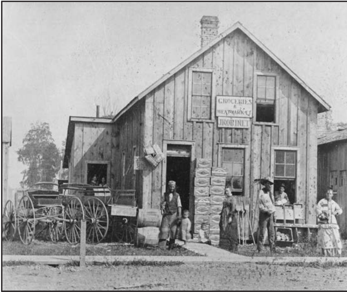
J. Robinet's grocery and hardware store.

for they indicate the existence of a second secret wine cellar attached by a hallway that could store a significant quantity of bottles that were delivered under cover of darkness. The purposes of this cellar leave the reader to wonder whether it was an attempt to circumvent the liquor laws, an attempt to conceal revenues from the tax man, or both.