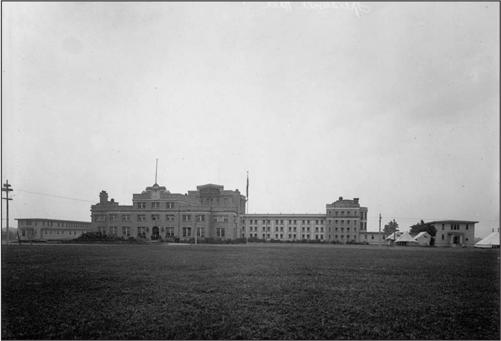
Speedwell Hospital prison, Department of Soldiers' Civil Re-Establishment. c.1918.

sion—now the Department of Soldiers' Civil Re-Establishment—faced tough questions from the Guelph branch of the Great War Veterans Association (GWVA) about the lack of “returned men” employed at Speedwell. The civilians at Speedwell, many employed at the prison farm before the war, were known as the “prison gang” among veterans. 60 Labels like these underscored the toxic environment between veterans and civilian administrators at Speedwell. The veterans argued that appointments of