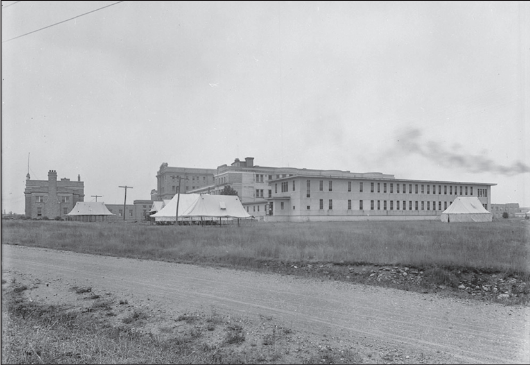
Speedwell Hospital, Department of Soldiers' Civil Re-Establishment. c.1918.

cials deemed Chapman's health sufficient enough to transfer him to Speedwell Military Hospital in Guelph.