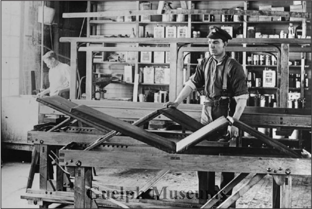
Soldiers making hospital furniture.