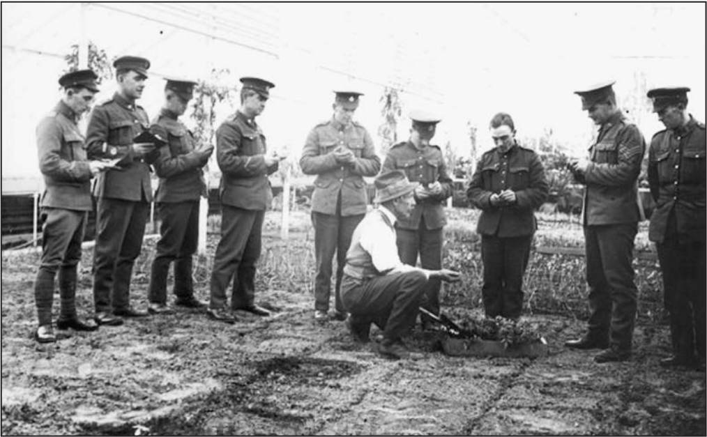
Gardening at Speedwell.

provincial customers with goods manufactured in its industries, but without the benefit of free inmate labour. This placed significant financial pressures on Speedwell's vocational program, which was compounded by limited funding from the DSCR. The second reason was the administration's unusual system of "dual control" that saw authority shared between civilians and military-medical personnel. The appointment of a business-minded civilian with close ties to the Provincial Secretary's Office, invested with vast authority and mostly indifferent to veterans' concerns, embodied the problems inherent in Speedwell's system of dual administrative control.