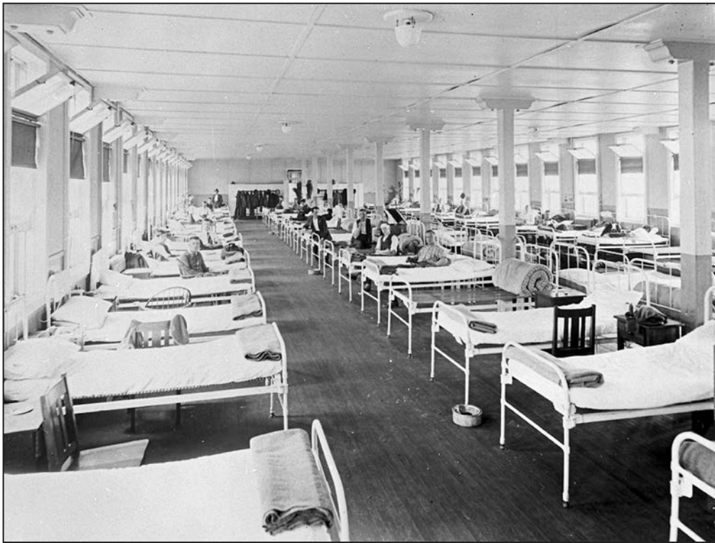
Speedwell [Hospital] Convalescent Ward, [Department of Soldiers Civil Re-Establishment, c. 1918]. Credit: Peake & Whittingham / Library and Archives Canada / PA-068096.