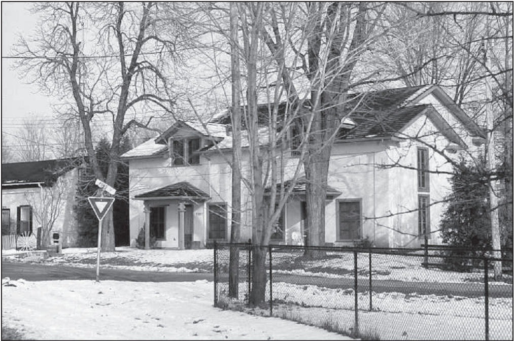
FIGURE 1. The two front porches at 7067 Pond Street show that it was once a double house. This structure, dating from the 1850s, was rebuilt as a single dwelling, and extended behind, in 1985. (Author photo, February 1987)