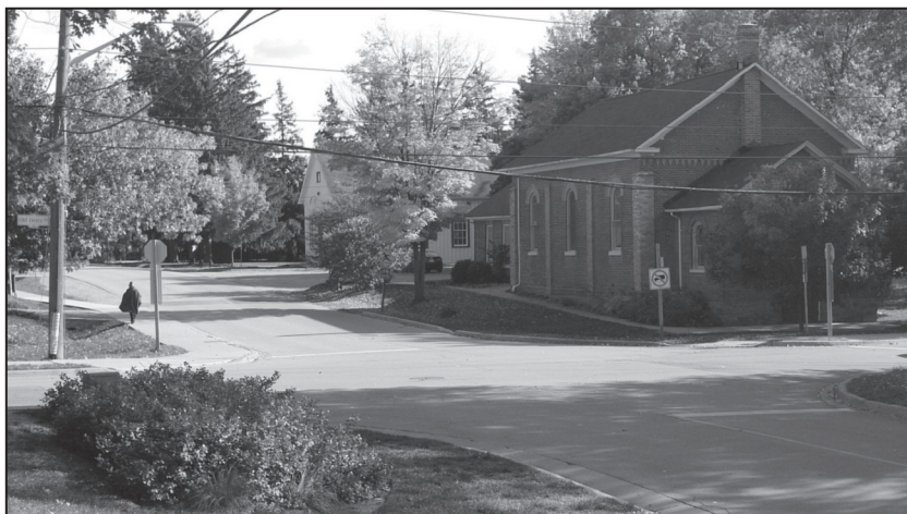
FIGURE 10. Looking southward along Second Line where it crosses Old Derry Road, in 2012. This might have been the intersection of two six-lane arterial roads. The 1863 Methodist Church stands on the southwest corner, with the 1871 village school (later, community hall) visible beyond.

routes to and from the rest of the city. Meadowvale has