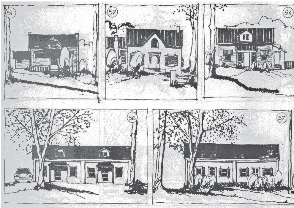
FIGURE 8. A Meadowvale collage, from sixty sketches by architect Bill Thomson, demonstrating the vernacular character of the village. (Meadowvale Village Heritage Conservation District Plan (City of Mississauga, May 1980), Appendix B, page A-15.

Less distinguished buildings, including garages and gazebos, country stores and barns, plus plantings, farmsteads, fences and more, got carried along with the concept. So did working-class housing. Few examples appeared on early listings of heritage buildings, but now such places as 7067 Pond Street started to be recognized.