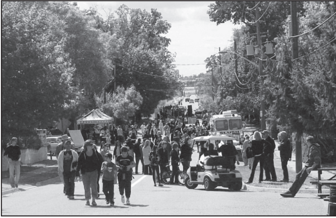
FIGURE 16. In September 2011 Old Meadowvale celebrated the 175 th anniversary of its supposed founding in 1836. Equally fitting would be a celebration of the very existence of this special entity in the fabric of the City of Mississauga.

of old Meadowvale. Both places built up and changed step by step. It may take a generation or more for locals to appreciate its significance, but I would venture that the Heritage Conservation District, the Village Character Area, and the Extended Village Character Area will grow together. Their boundaries and contrast may well diminish into a seamless mass that will sustain the sense of generation upon generation of the use of city space. A sympathetic rind embracing the designated core may be the next step on the path to an enlarged conservation district.