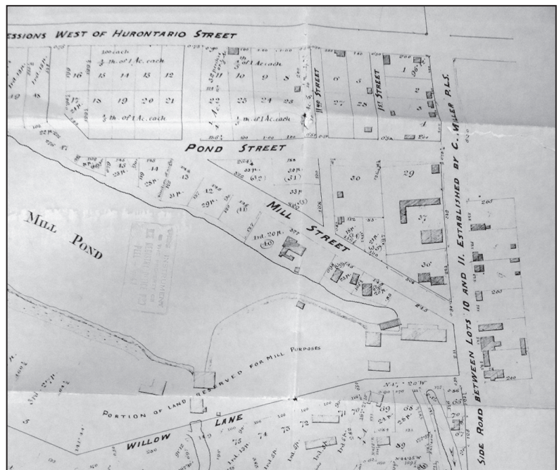
FIGURE 4. In July 1856 Francis Silverthorn registered this plan of subdivision (oriented eastward) of the village of Meadowvale, on a part of the east half of survey Lot 11, Concession 3 WHS. Village lot 10 on Mill Street (now named Old Mill Lane) is the site of 7050; village lots 18 to 21 on Pond Street are the sites of 7079 and 7067. Silverthorn's mill is the large building at the corner of Mill Street and Sideroad 10-11.

schoolhouse, wagon shop, general merchants, shoemaker and postmaster. 10 The