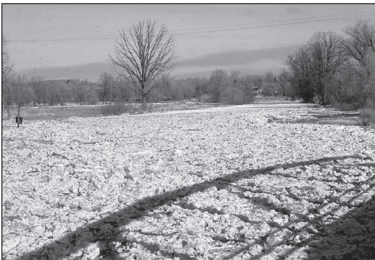
FIGURE 12. Meadowvale village is at its most rural-looking as one approaches from the west. An ice-jam in January 1973 dramatizes the role of the river and its flood-plain as recreational green space out of reach to suburban development.

one questionable limit was Second Line south from the community hall, along which extended that straggle of mainly builder-built houses on odd-sized lots severed from adjacent farms between the 1920s and the 1960s. Second Line south was an unplanned continuation of the incremental evolution of the older village, but was ignored by heritage interests. In 1980 it simply did not meet HCD expectations.