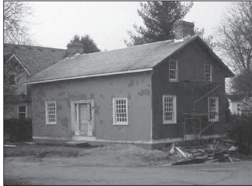
FIGURE 15. This house stood on a vulnerable site more than 50 km distant. In 1998 it was moved to a perceived safe haven in Meadowvale HCD. Finished in a light stucco and the site landscaped, this has become an integral element of the village fabric. (December, 1998. Author photo)

called styles as the old ones succumb to age, neglect, or fire, the concept of a village is unlikely to fade. One resident has gone to the extraordinary length of moving a frame house more than 50 km from a vulnerable site in Richmond Hill to a vacant lot at the corner of Barberry Lane and Pond Street in 1998. (Figure 15) Once it was landscaped and settled, this 1830s-era dwelling looked as if it had always been there, and indeed it could have been. It nicely complements and enriches the earliest images of the village, and could have been a working-man's dwelling. Log and timber frame buildings were built to be moved, and often did so as farmland was cleared and wells were dug, so there is nothing particularly inauthentic about this procedure. This is just one of the many remarkable Meadowvale stories, and recalls the comment made in 1973