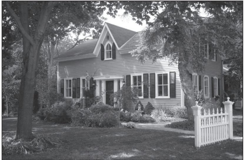
FIGURE 3. Francis Silverthorn built this storey-and-a-half house for himself in the late 1840s. 7050 Old Mill Lane.

1856. (Figure 4) We know almost nothing about the occupants of these four dwellings, beyond the fact that they were tenants and left no imprint on the title deeds or assessment roles. The decennial censuses may yield some clues to the enterprising genealogist, but are problematical. 9