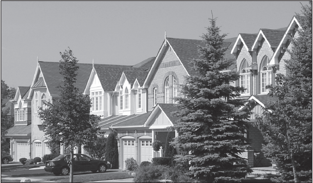
FIGURE 14. Gothicism and steep gables prevail in the Extended Village Character area.

Gothic window that defines the Character and Extended Character areas. (Figure 14) “What hath LACAC wrought?” one might ask, but in fact this response is exactly what should have happened. Silverthorn (or an early successor) did it to 7050 Old Mill Lane in Meadowvale’s nascent years (Figure 3), so what’s new? Gothic detail is vernacular Ontario, here in its 1990s style, with ordinary tract builders doing what they thought was right. They have taken their cue from Ontario’s heritage movement of the past half century. Gothic windows are strongly associated with Ontario farmhouses, so they may in fact be considered working-class features, now boldly commemorated in the extended Meadowvale suburban setting. 48 These outliers of the Meadowvale HCD are part of the n th