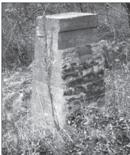
FIGURE 11. This pillar of poured concrete bears the imprint of a beam and foundation stones in the Silverthorn Mill, torn down in 1954. It is a memorial to the founding of this industrial village more than 160 years ago, and was still standing in 2012.

The Credit River defines the hypotenuse of this triangular hamlet, and is a