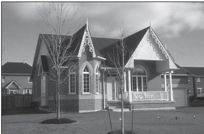
FIGURE 13. A Monarch Home, freshly built and landscaped, in the Village Character Area, December 1998.

planners as the Village Character Area, was generally one or two streets deep, and buildings there were to incorporate ‘heritage elements’ in a persuasively overt manner. Beyond this zone was the Extended Village Character Area. Here the sense of heritage was to be more subdued, and at its outer limits was to blend seamlessly into the suburban city further afield. 45