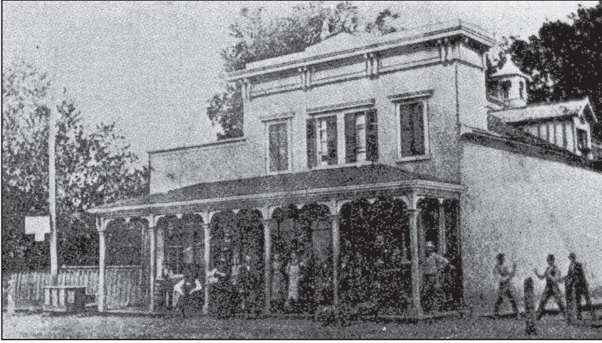
FIGURE 5. William Gooderham's store, about 1885. It burned in 1907.

Methodist congregation and its pastor got a church building in 1863 (still in use in 2012), but never a cemetery; caskets went upstream to Churchville for burial. Teamsters took grain and flour along Centre Road (Hurontario Street) to Brampton for delivery to the Grand Trunk Railway, newly opened between Toronto and Stratford during 1856. All these activities, plus the increasing assort-