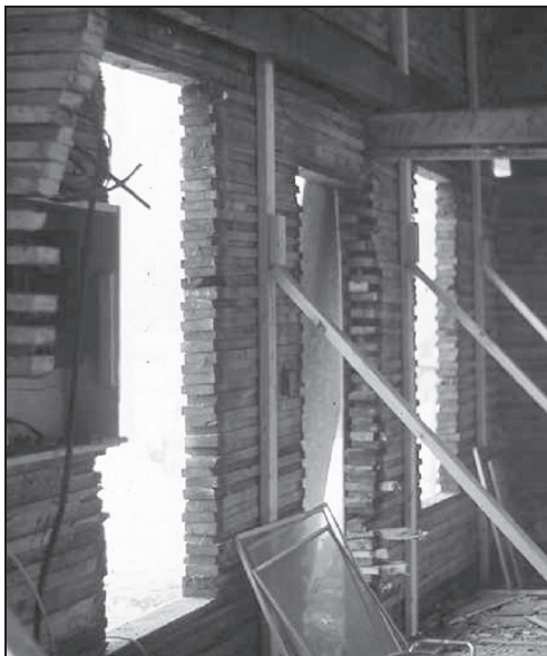
FIGURE 2. Short 'seconds' left over from the sawmill were nailed together in the plank-on-plank construction technique. Planks were offset in order to provide an uneven bonding surface for stucco and plaster. This is 7067 Pond Street during rebuilding in February 1985. (Author's photo)

terpower streams in southern Ontario. 3 A sawmill and a grist mill were running later in 1845 with an unknown number of hands at work. The gristmill burned in 1849, Silverthorn rebuilt, and was back in full business in 1852. Later he added a barrel and stave factory and entered into flour milling. Wood from the sawmill was reportedly used in planking Hurontario Street in 1849, a labour-intensive activity to be sure. In 1853 the Johnson brothers started manufacturing farm machinery at their Mammoth Iron Works and Foundry. They employed twenty men at first, a