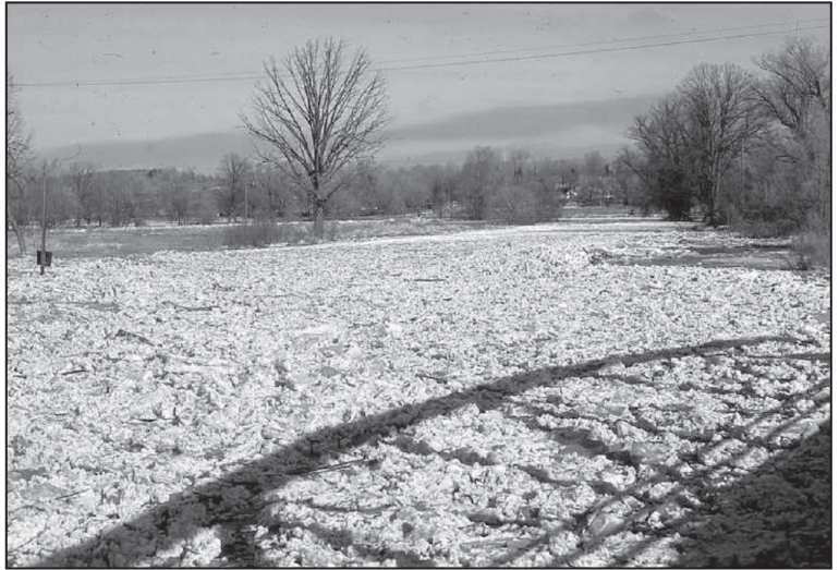
FIGURE 12. Meadowvale village is at its most rural-looking as one approaches from the west. An ice-jam in January 1973 dramatizes the role of the river and its floodplain as recreational green space out of reach to suburban development.

one questionable limit was Second Line south from the community hall, along which extended that straggle of mainly builder-built houses on odd-sized lots severed from adjacent farms between the 1920s and the 1960s. Second Line south was an unplanned continuation of the incremental evolution of the older village, but was ignored by heritage interests. In 1980 it simply did not meet HCD expectations.