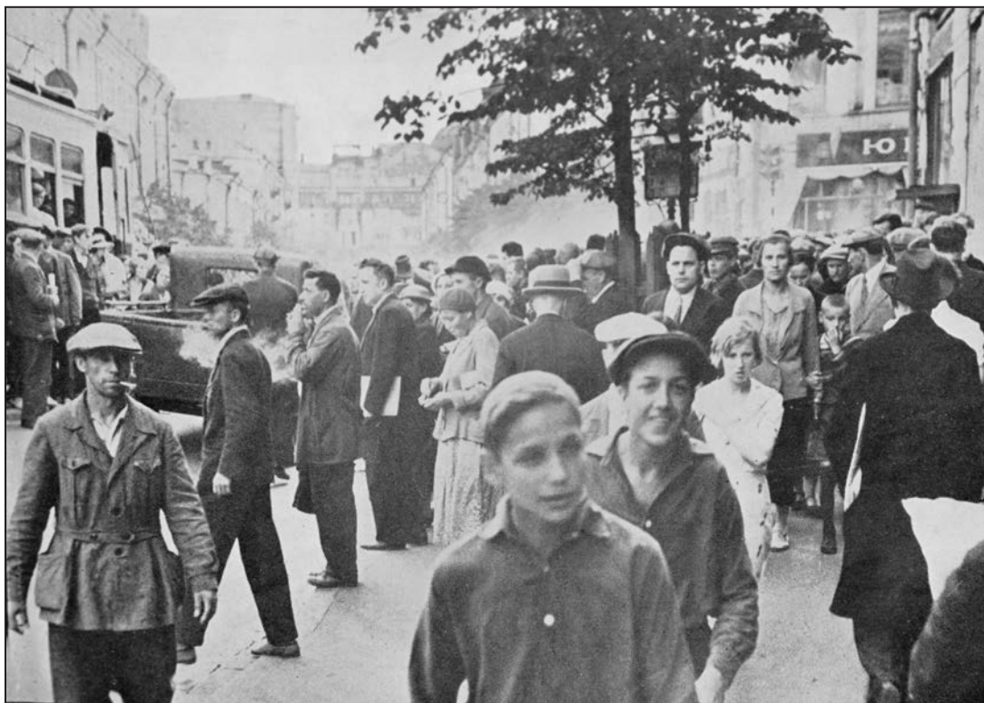
Figure 6: Submission is written on their faces and in their bearing. Or, so Drew thought in 1939 when this 1937 photograph was published. Photograph illustrating George Drew, "How Powerful is Russia?" Saturday Night, 11 November 1939, 2.

servation that "laughter dies hard when one is young," Drew now recalled that "even among the young people [in Moscow] smiles are rare. There is no spirit of enthusiasm in their expressions, no suggestion of initiative of any kind. Submission is written on their faces and in their bearing" (Figure 6). Moscow had become more unpleasant than it had been when Drew described it in 1937. Now, in 1939, Drew recalled that the city was "dull and