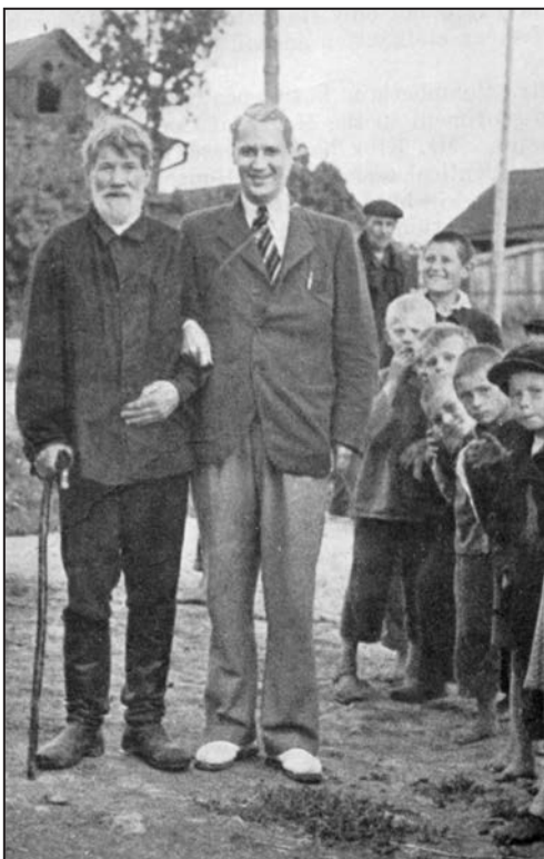
Figure 4: Drew visits a collective farm. Drew (as if there could be any doubt) is the adult figure on the right, in the white shoes. Photograph illustrating George Drew, "How Powerful is Russia?" Saturday Night, 11 November 1939, 2.

world." Drew anticipated that "hundreds of thousands of Russians will die of starvation during the coming winter, unless a miracle of reorganization takes place in the next few months." 44