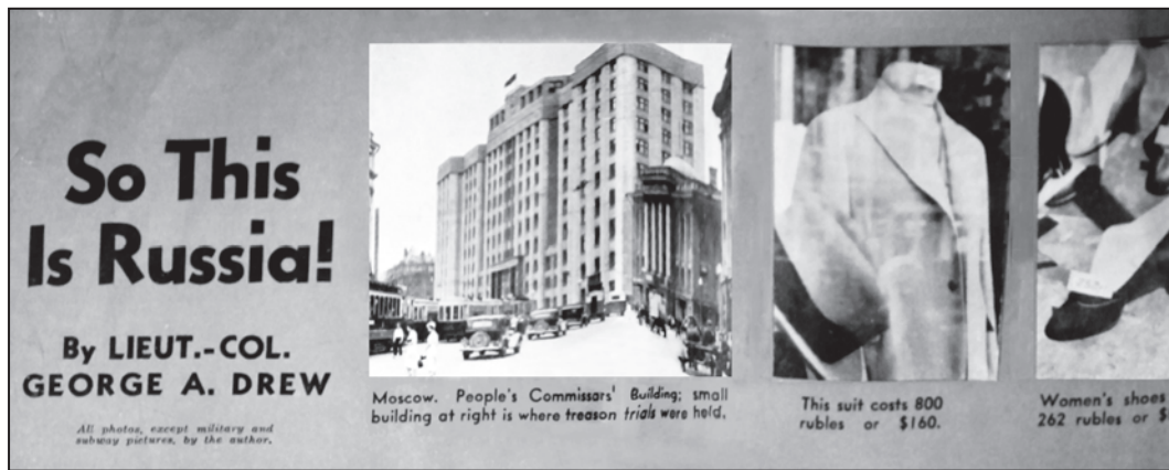
Figure 3: So this is Russia! In 2015 dollars, the $160 suit Drew has photographed would cost about $2,650; the $50 high-heeled shoes about $828. Because part of Intourist's mandate was to accumulate hard foreign currency, the exchange rates charged to tourists for rubles was exorbitant. Drew's prices were likely those advertised in TORGsIN , a chain of stores with expensive imported goods where tourists were encouraged to shop.

maintenance in the USSR, but he could speak from personal experience to contradict the “complete sham” display of Soviet railroad equipment: “I travelled on the main line from Warsaw to Moscow and I was not aware... that there was still in existence such primitive railway equipment in the world.” He had seen troop trains as well, and the men “were filthy... with a general appearance of inefficiency.” Soviet inefficiency—in contradistinction to Nazi efficiency—was a frequent theme.