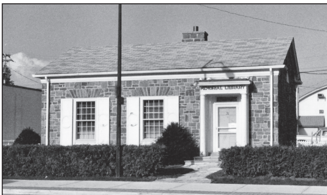
Fig. 2 Colwater Public Library, 1980